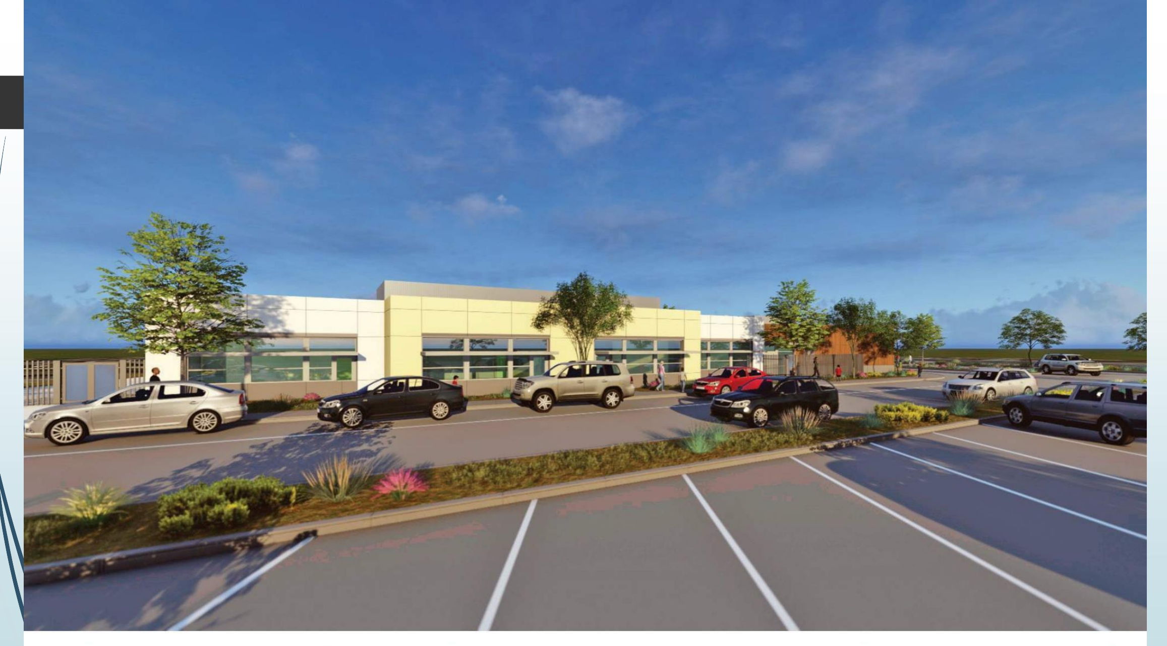
New Elementary School in Foster City - View from Beach Park Blvd, Looking North, of Passing & Drop-off Queuing Lanes