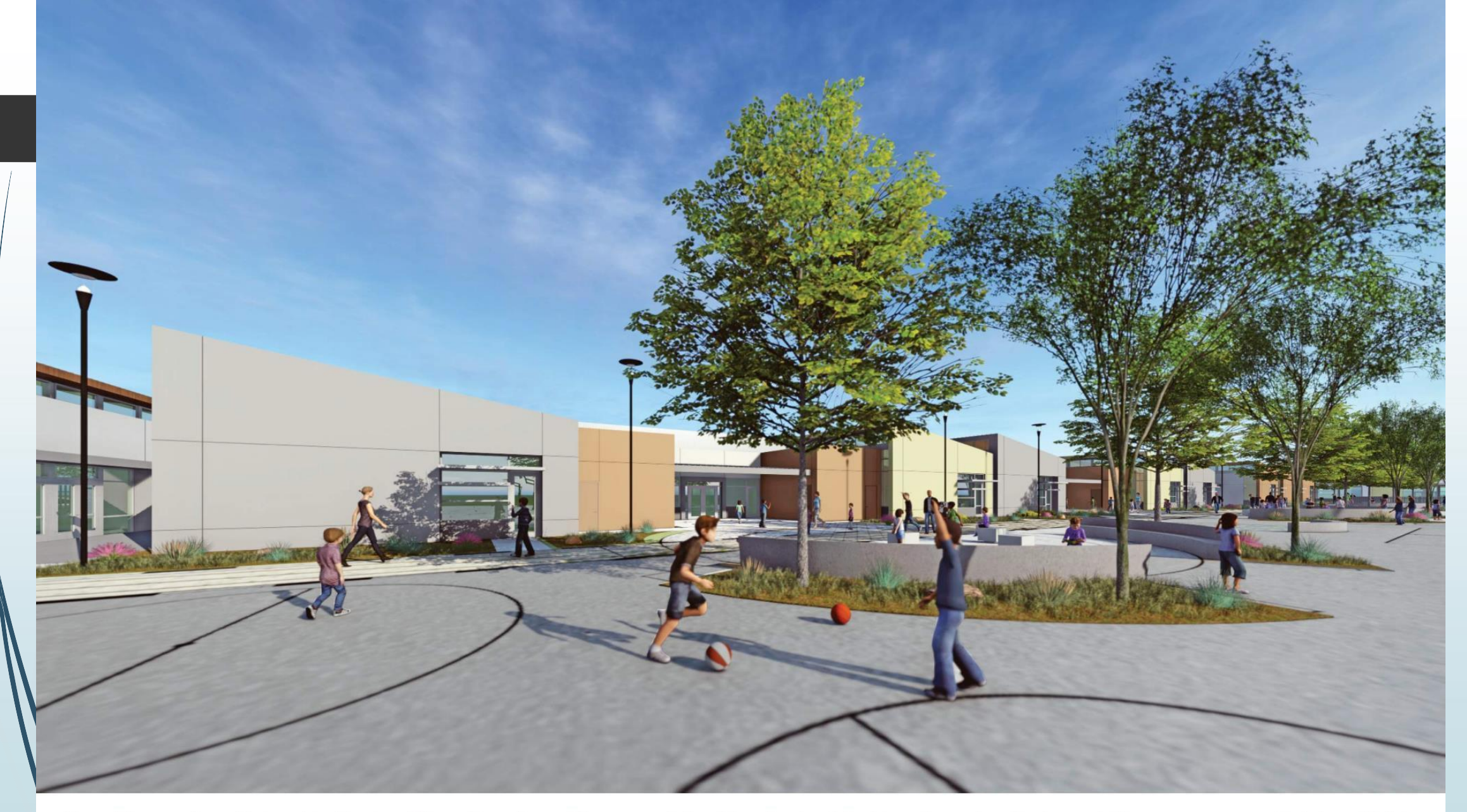
New Elementary School in Foster City - View from Playground, Looking East, of Outdoor Learning Node and Classrooms