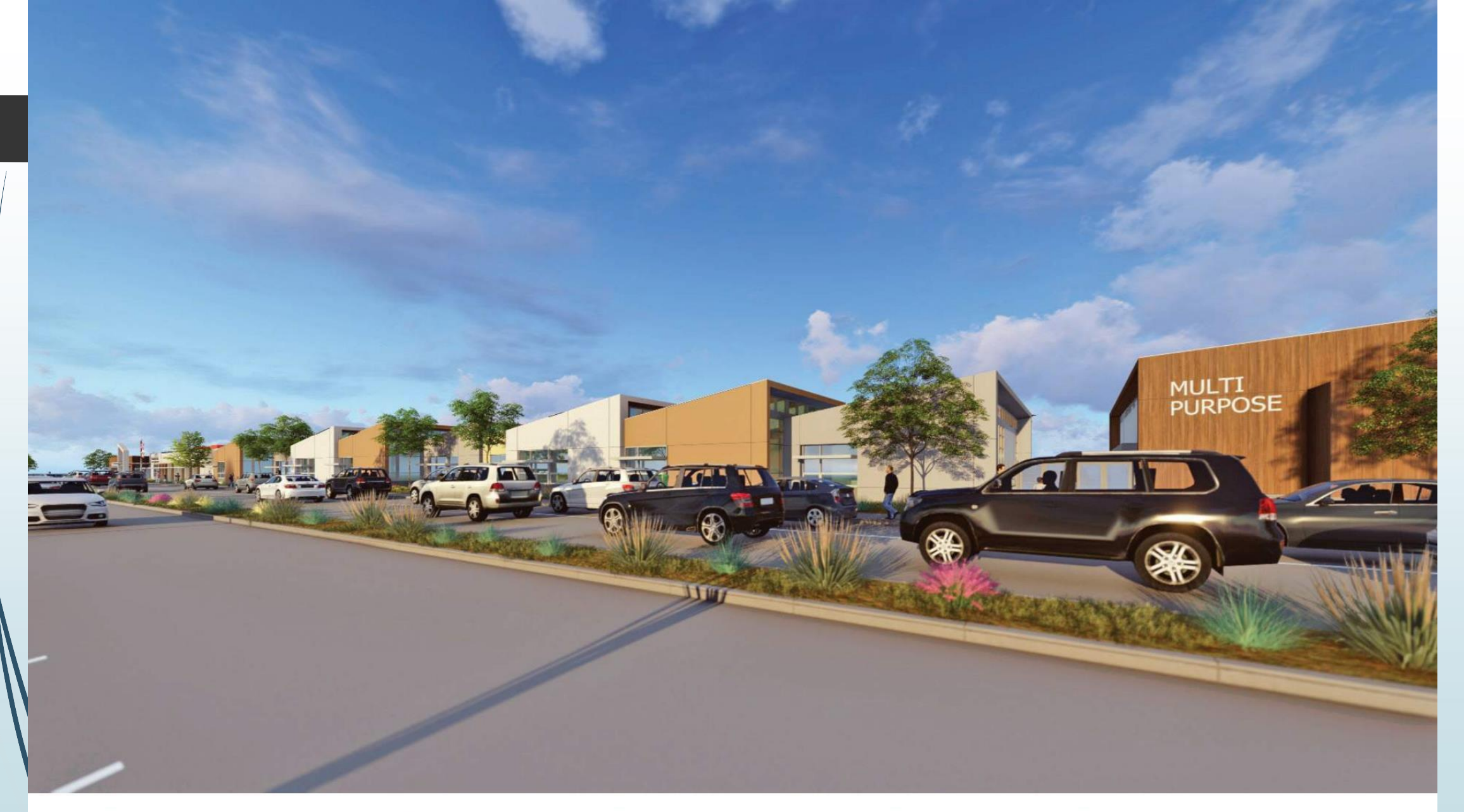
New Elementary School in Foster City - View from Shell Blvd, Looking South-West, of Passing & Drop-off Queuing Lanes