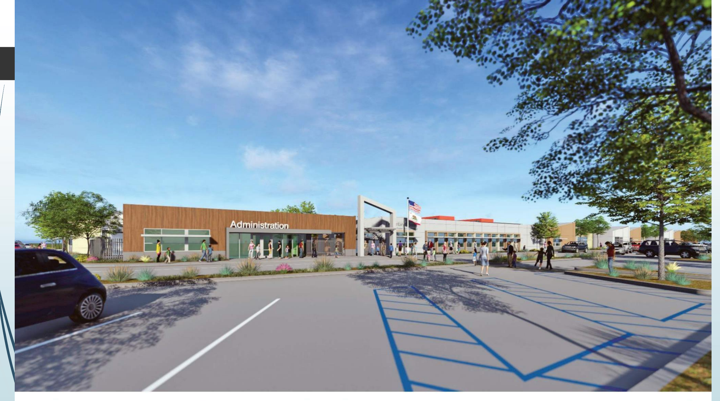
New Elementary School in Foster City - View from Shell Blvd, of Pedestrian Entrance and Vehicular Exit