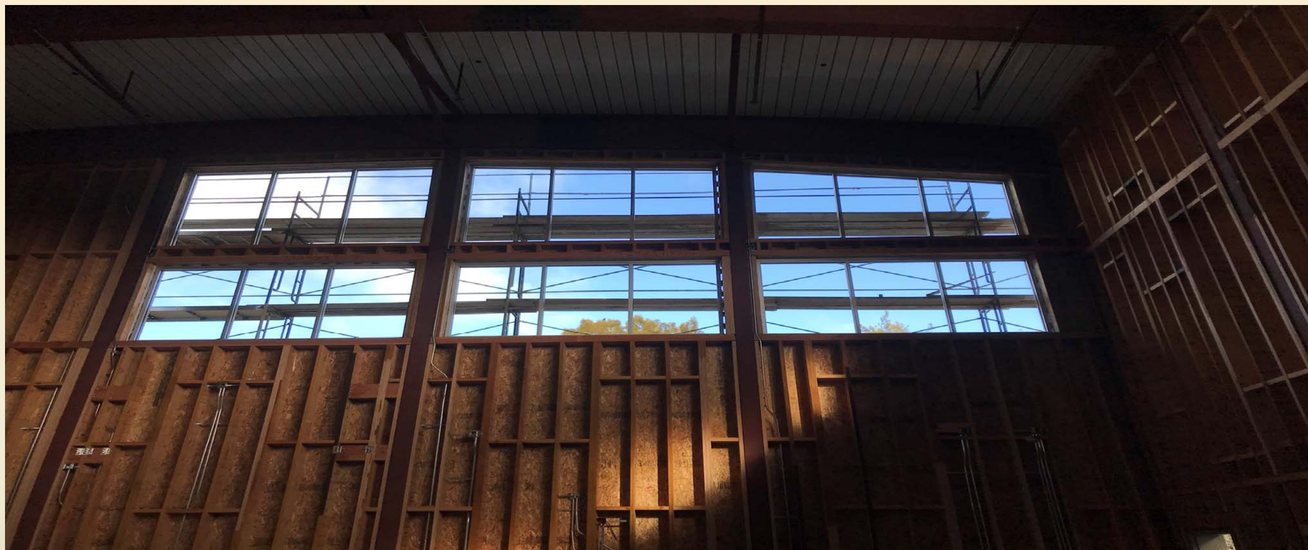
Gym Clear Story Windows