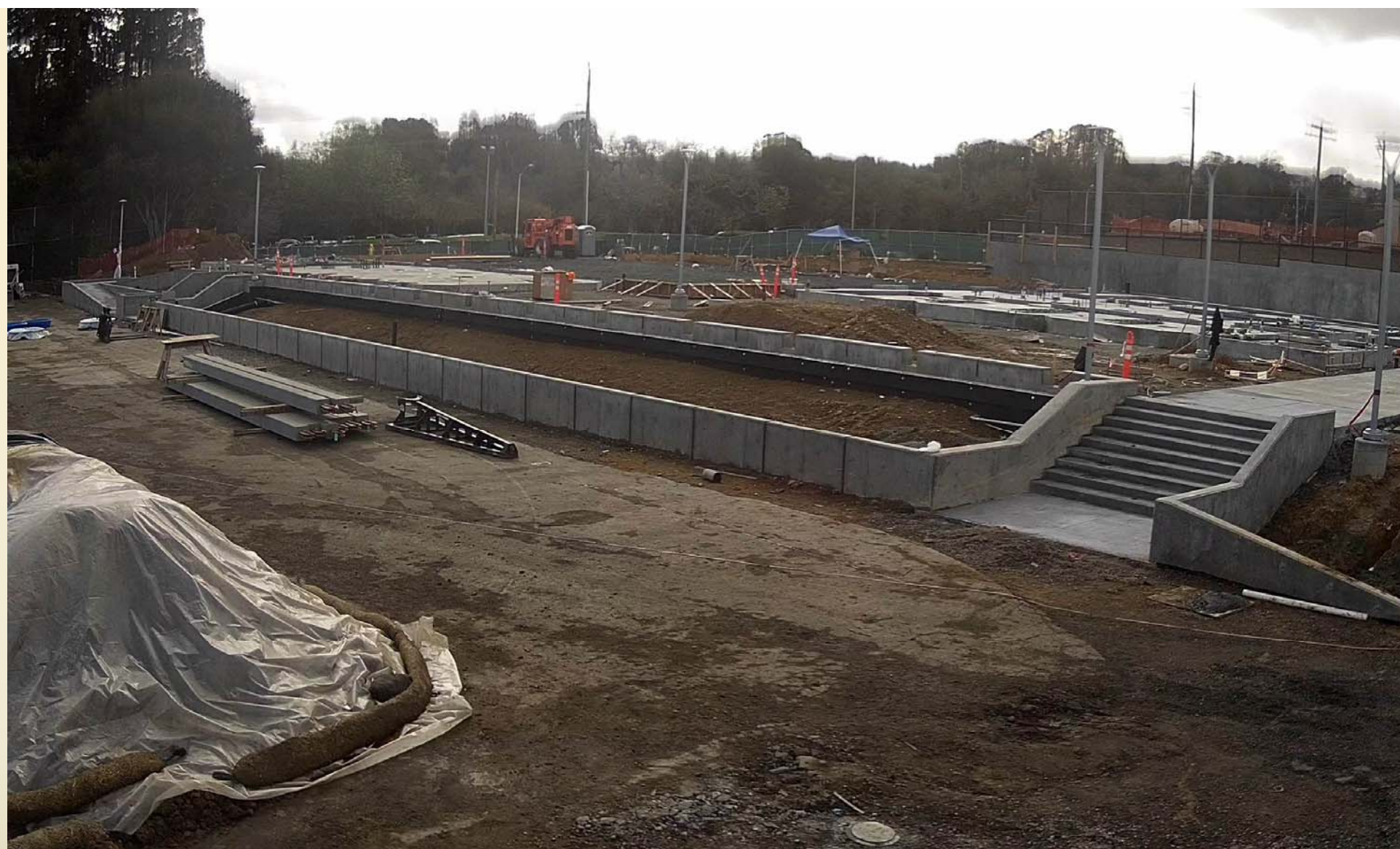
Bio swale/Planter with Gym View at Back