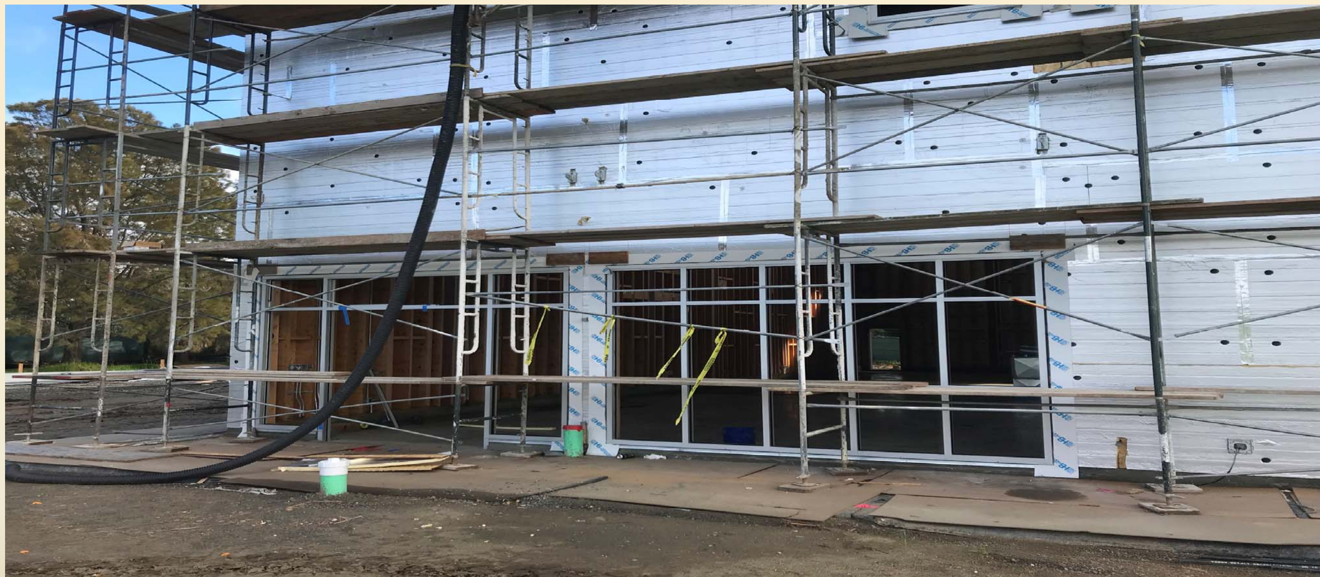
Exterior Scaffolding Set-up for Scratch and Brown