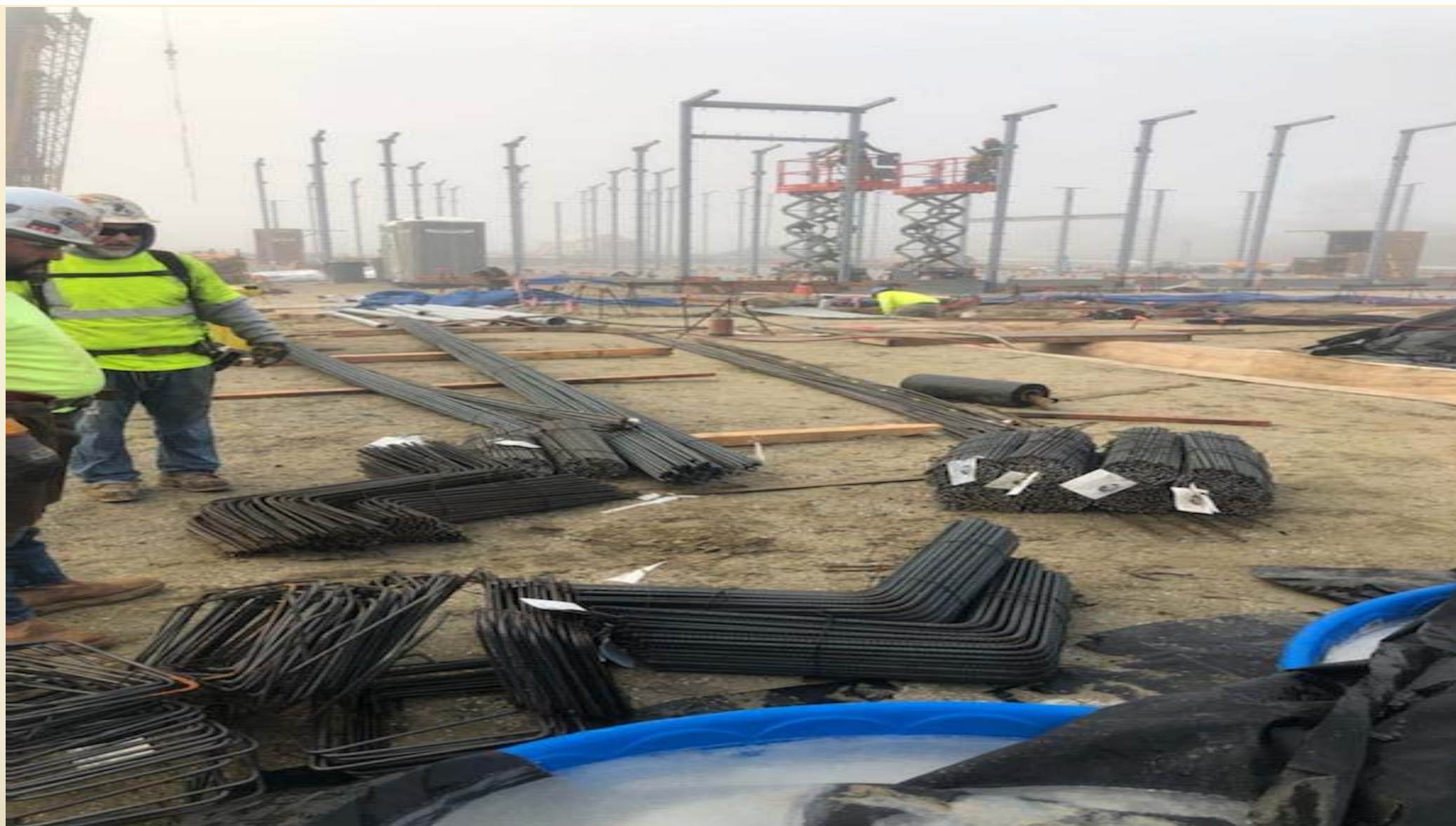
Building B1 Classroom Cluster - Rebar