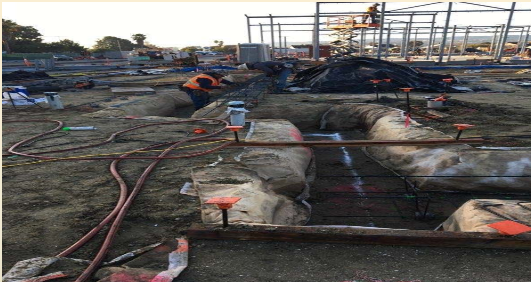
Building A Multipurpose Room Footings