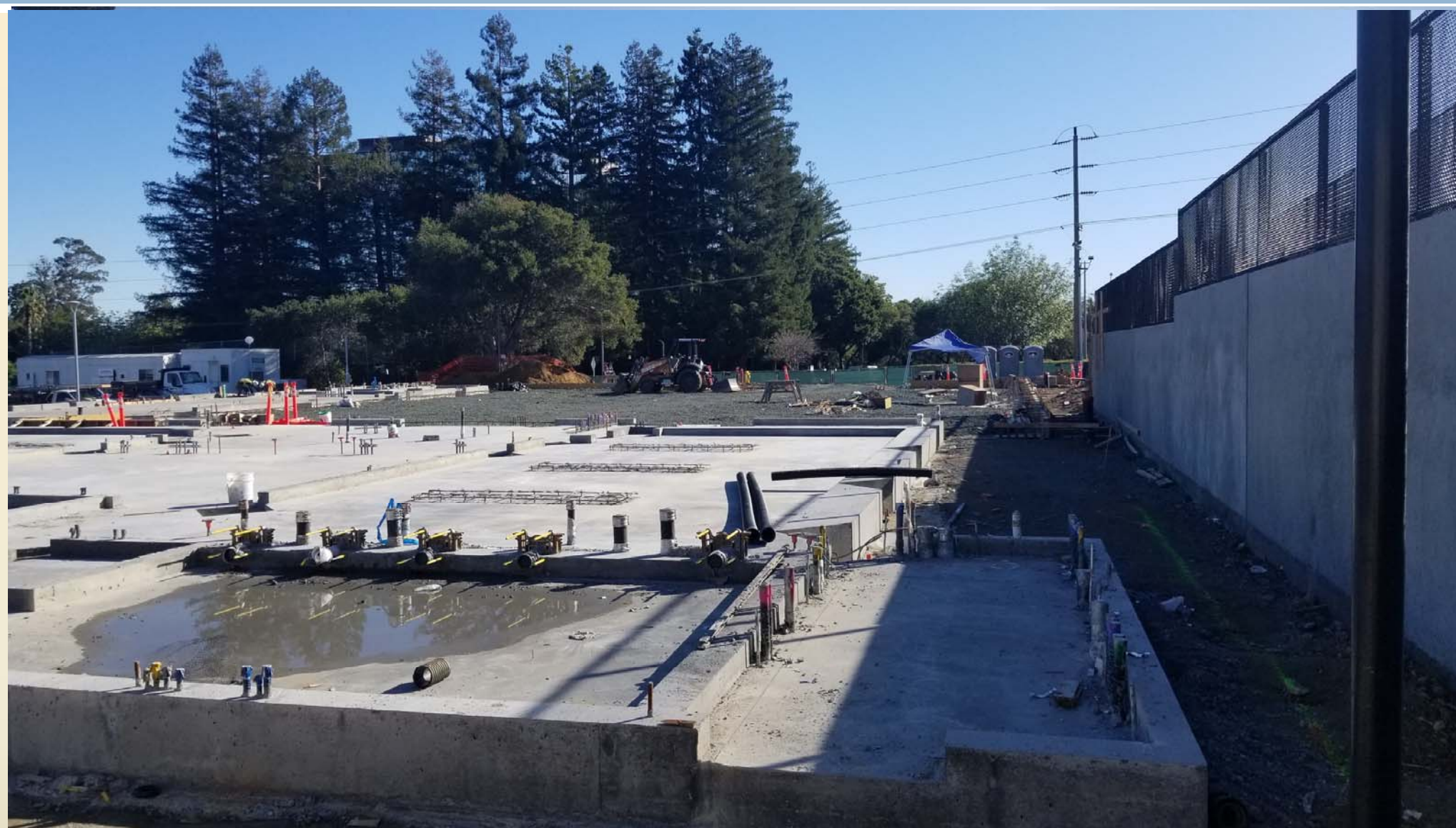
Completed Gym Slab South East View