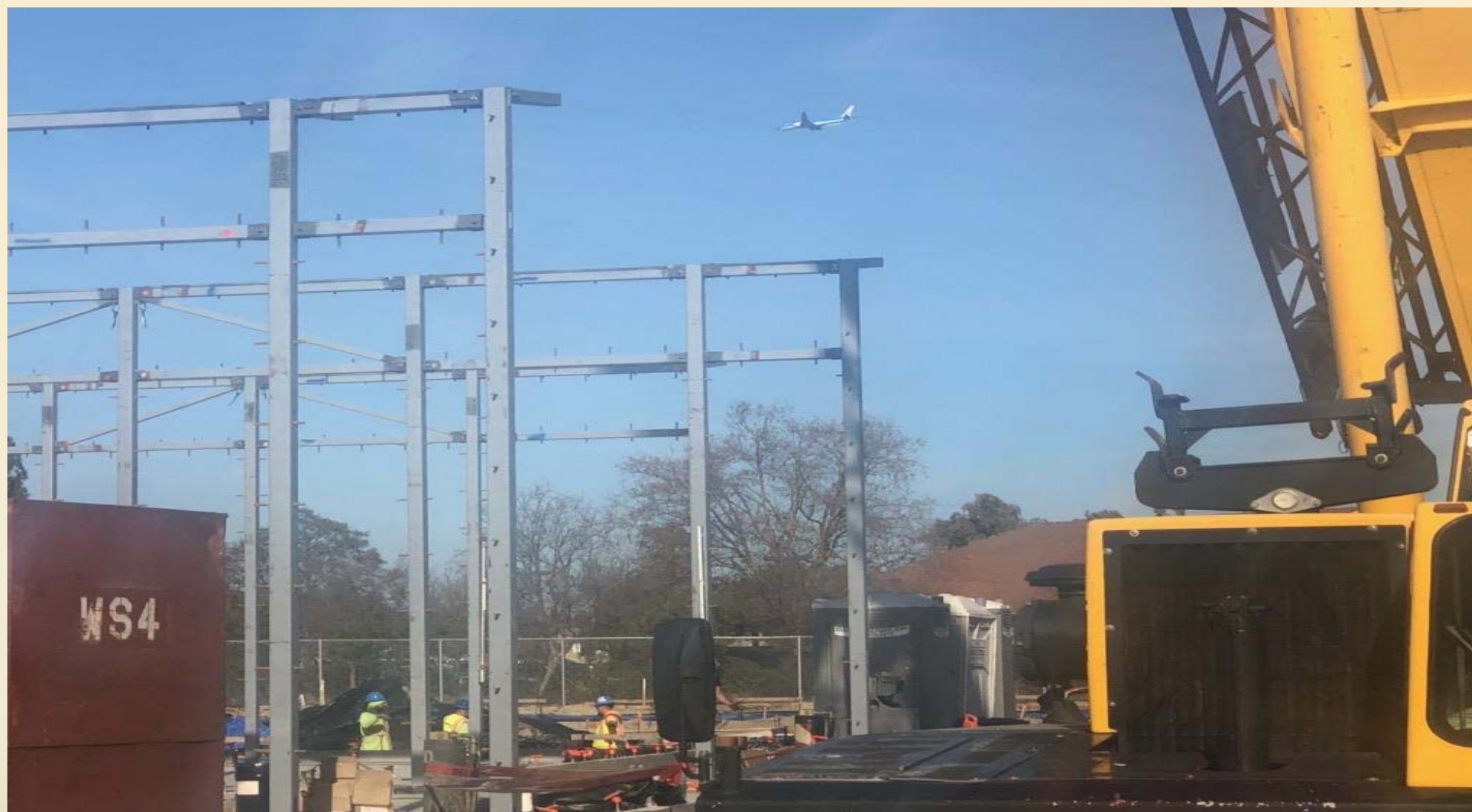
Building B1 Classroom Cluster - Framing Continued