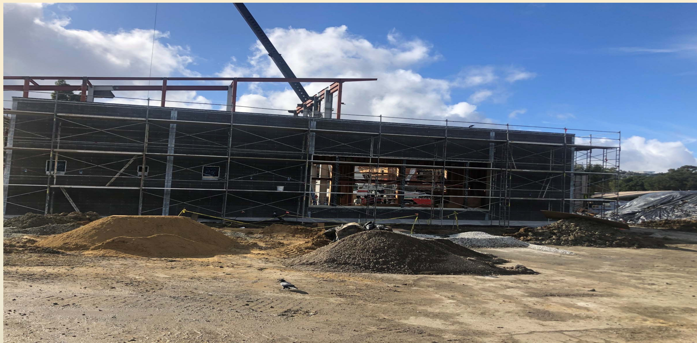
Gym Lobby Entry off Plaza