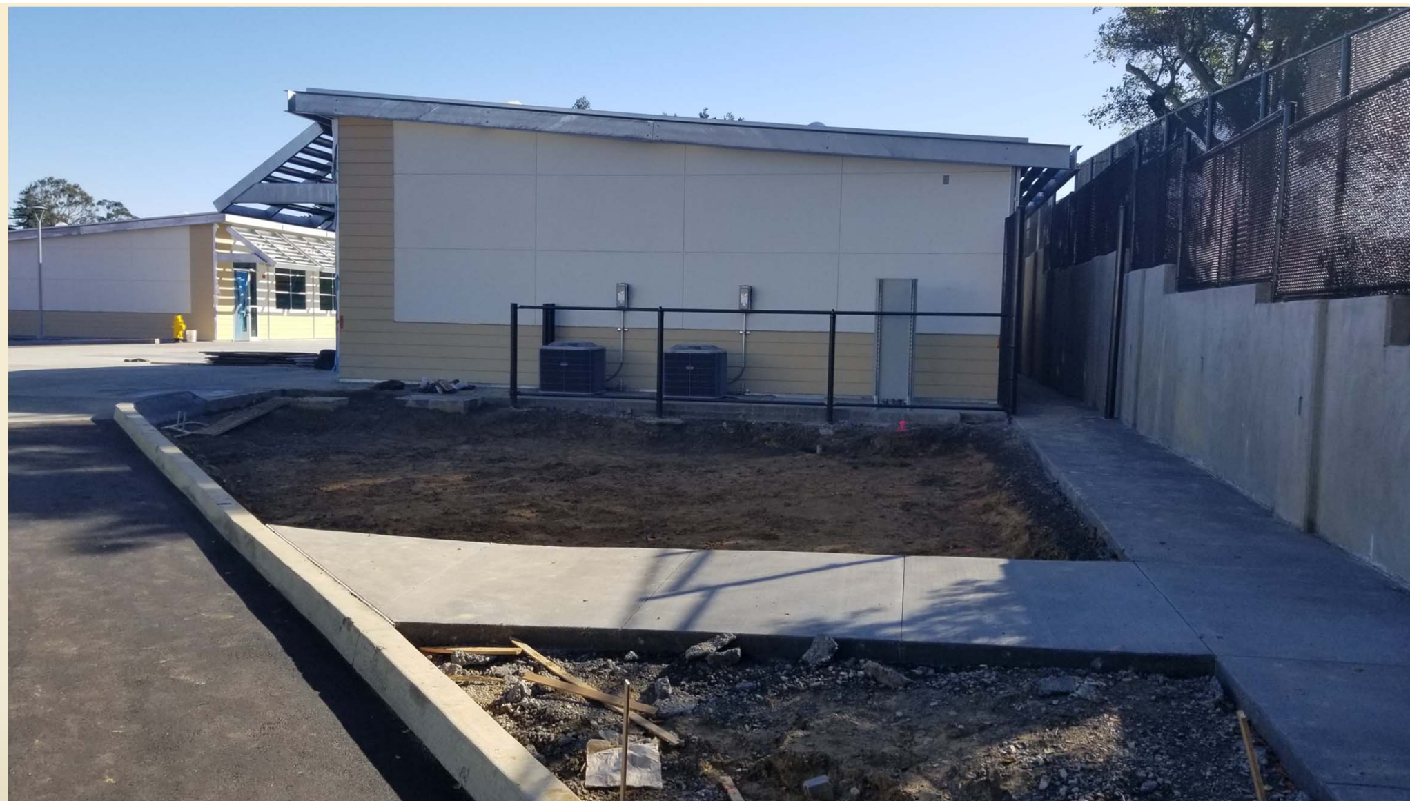
Four Cluster Classroom and Two Cluster Classroom in Background