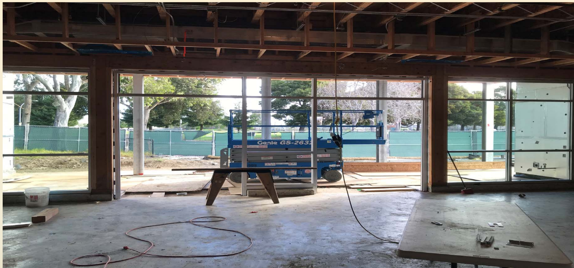
Gymnasium Main Lobby