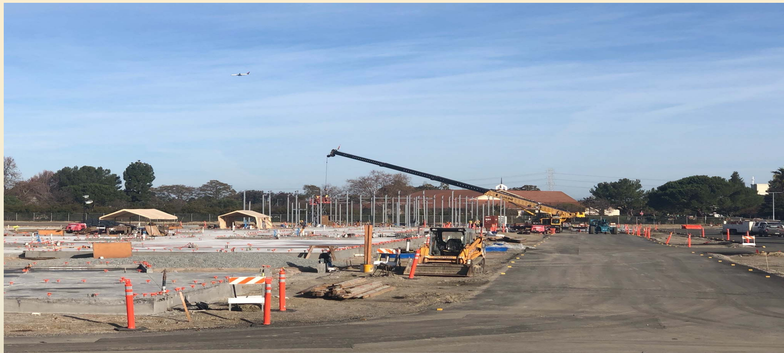
New School Site (Formerly Charter Square Shopping Center)