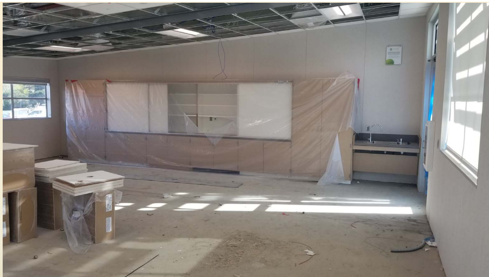
Classroom Interior View to Teaching Wall