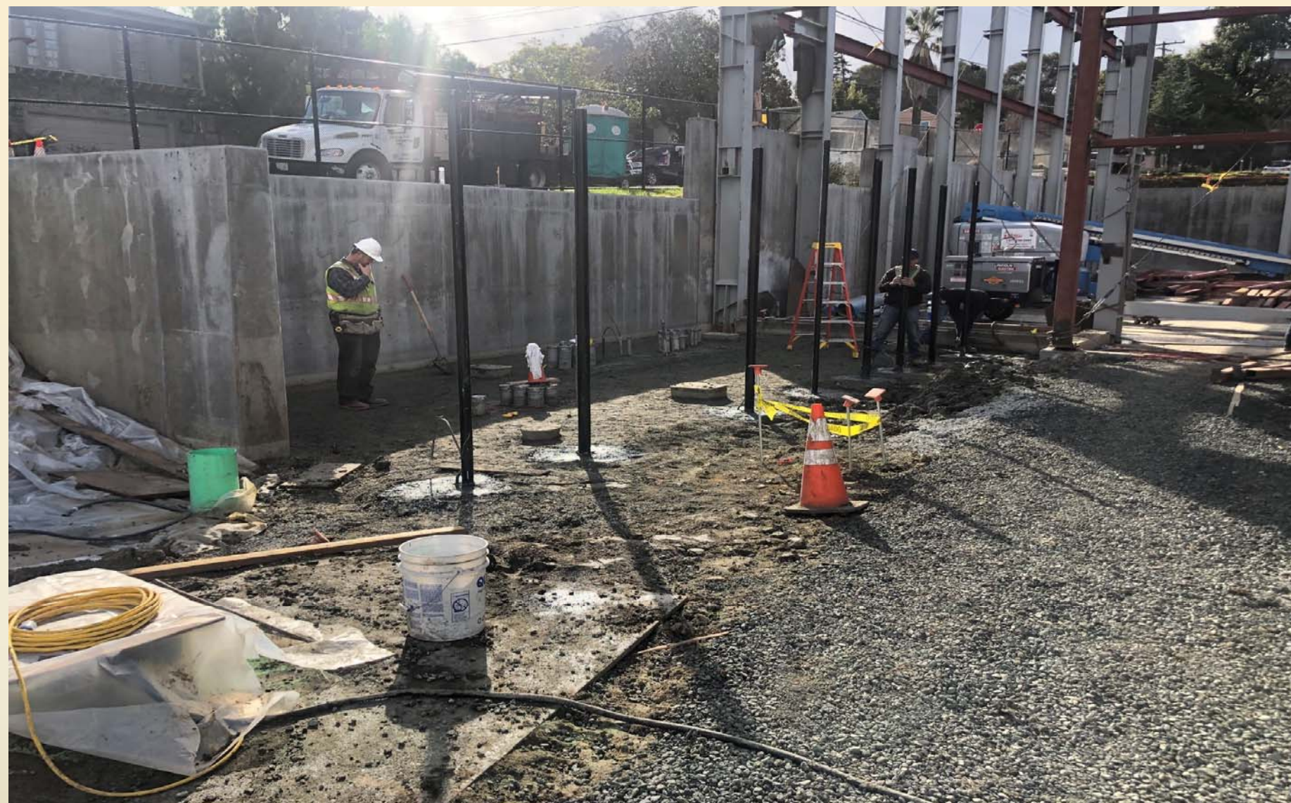
PG&E Service Area