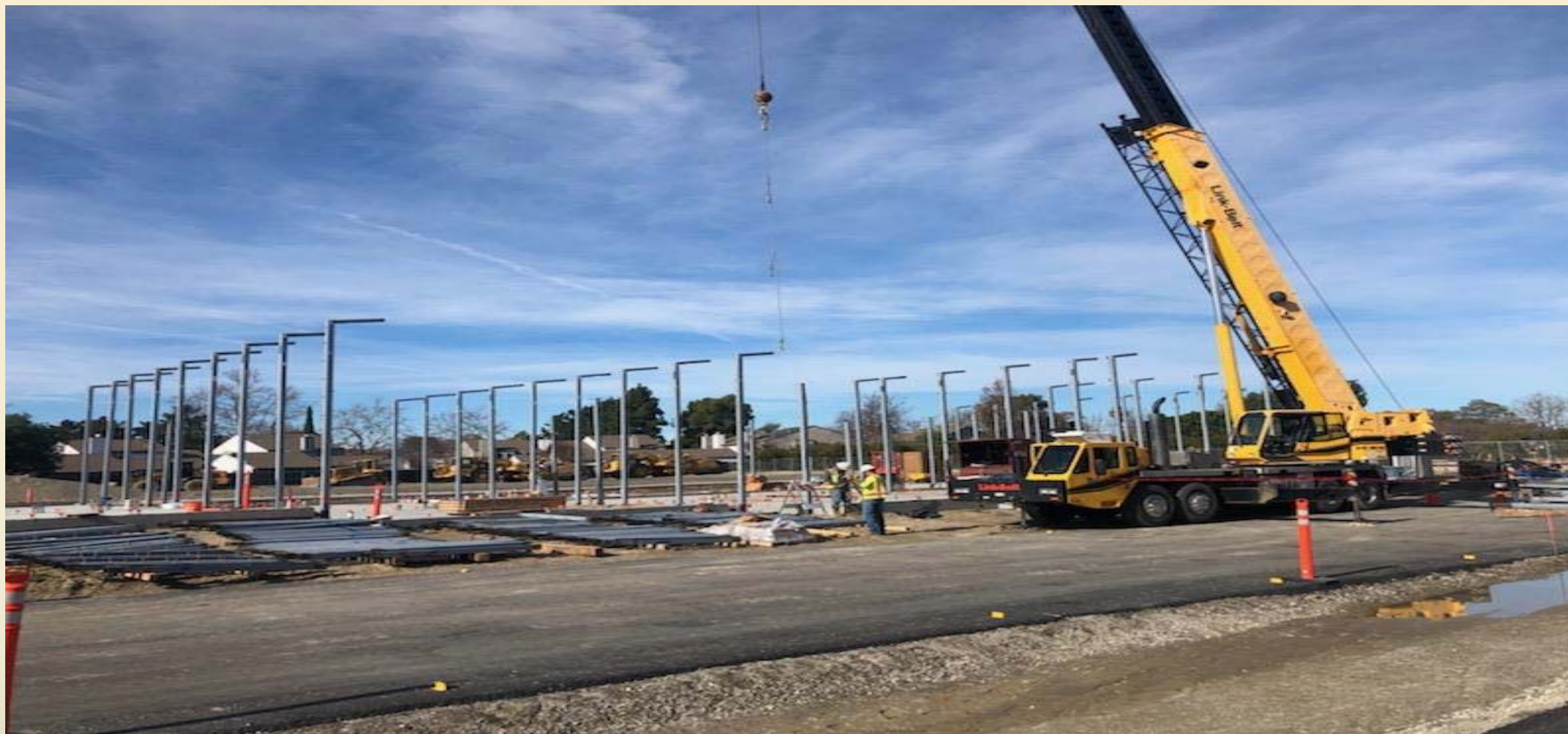
Building B1 Classroom Pods - Steel Framing