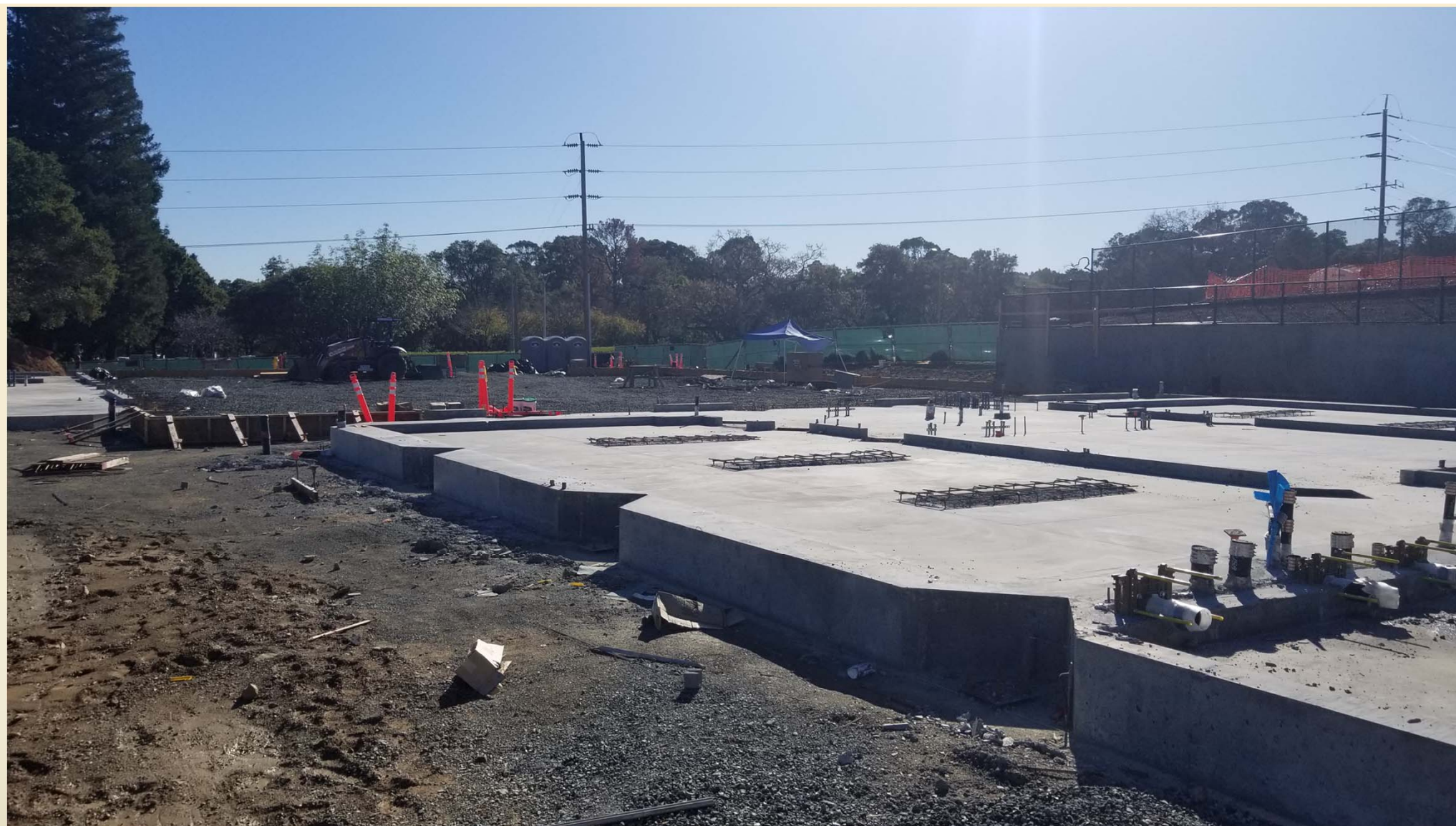
Completed Gym Slab