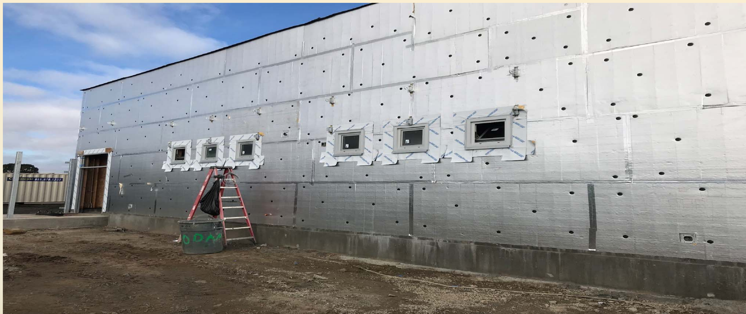
Exterior Scaffolding Set-up for Scratch and Brown Pic 2