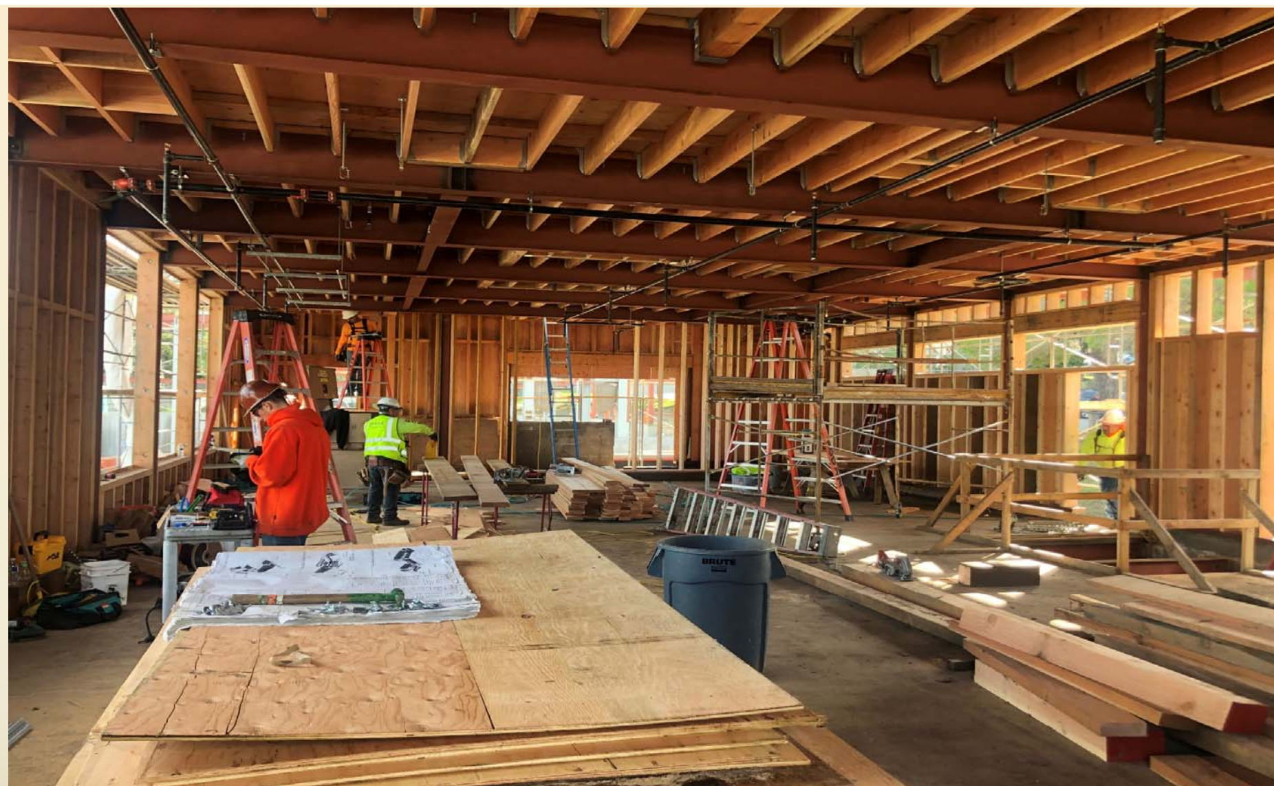
Interior view of Classrooms