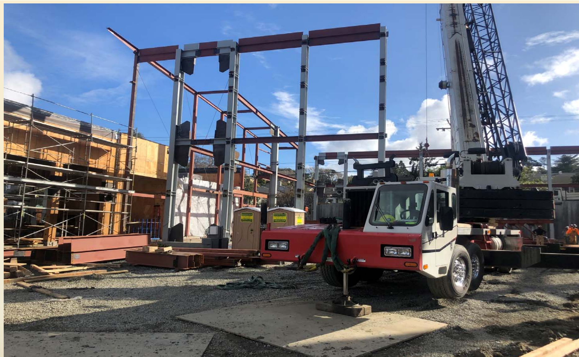
Gym Steel Framing