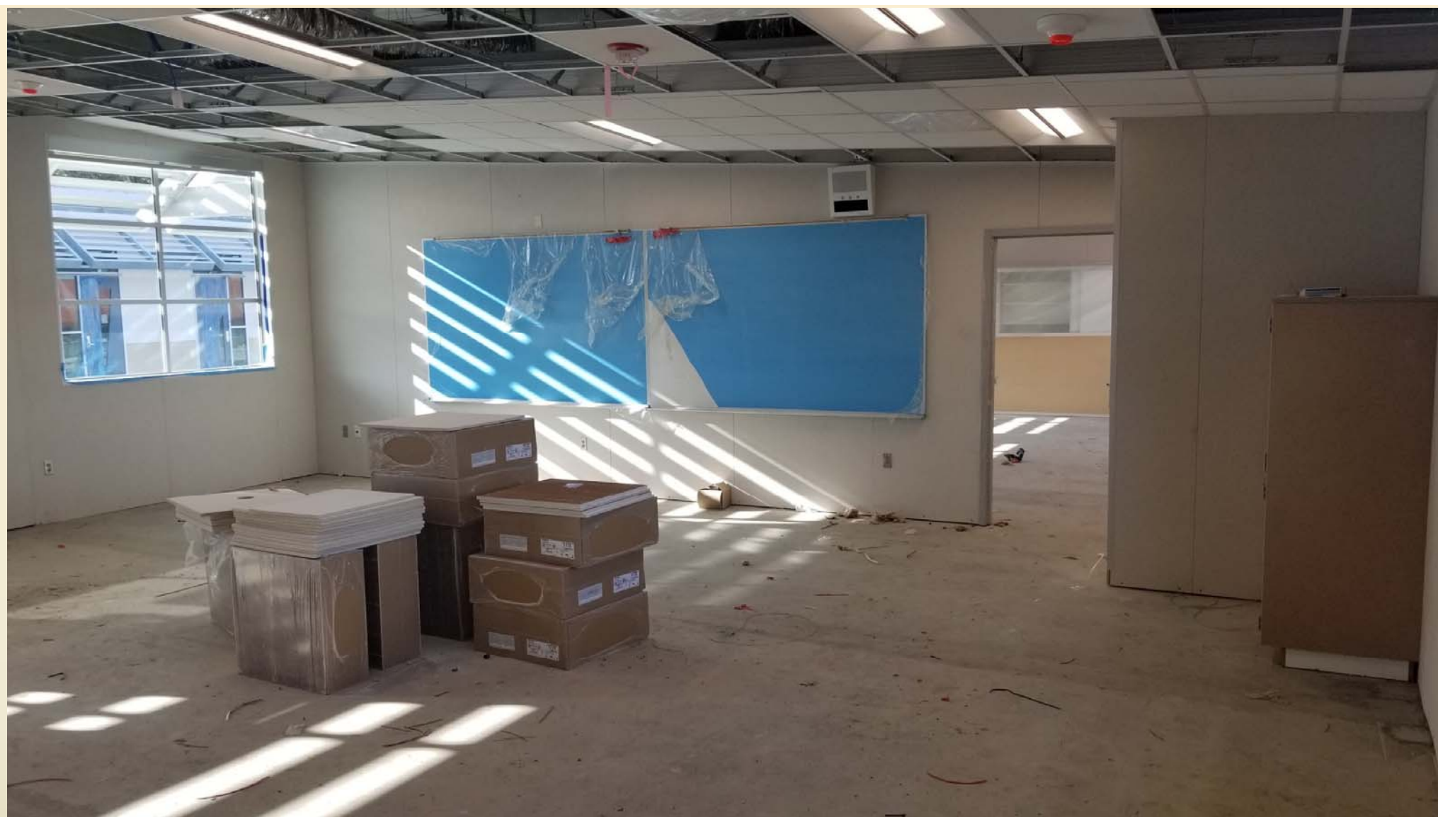
Classroom Interior View to Back of Classroom