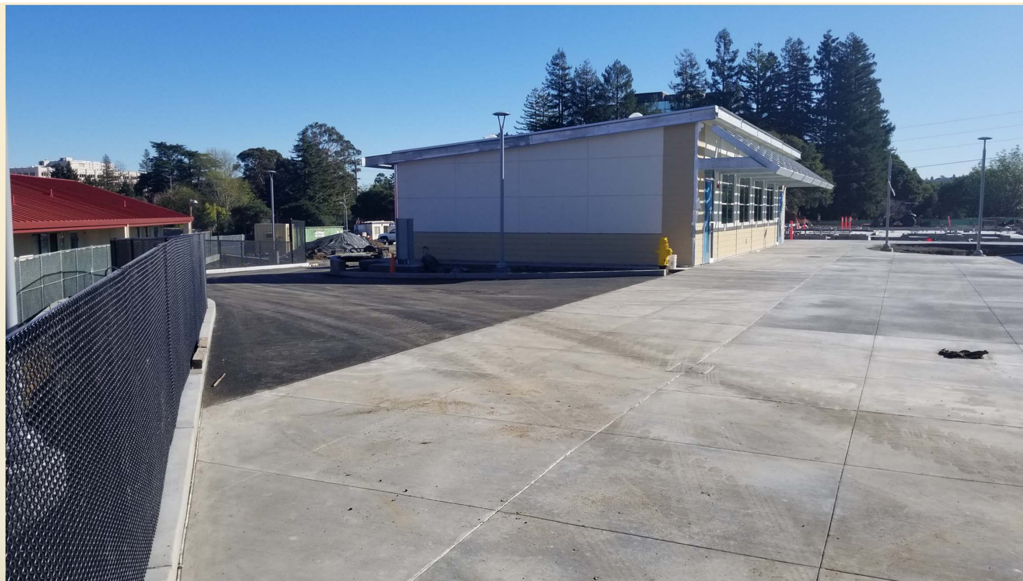
Courtyard View with One Classroom Cluster