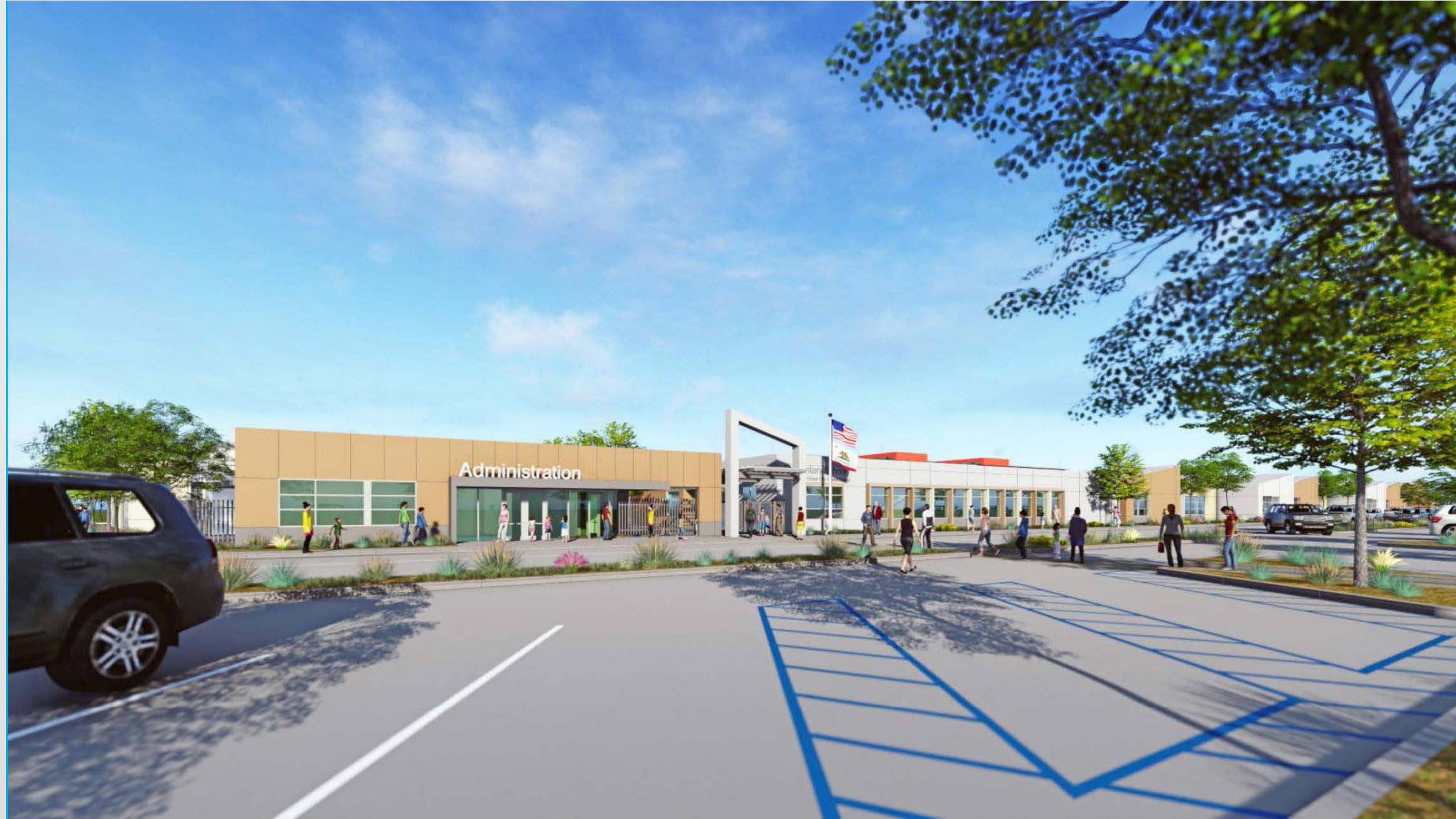
New Elementary School in Foster City - View from Shell Blvd, of Pedestrian Entrance and Vehicular Exit