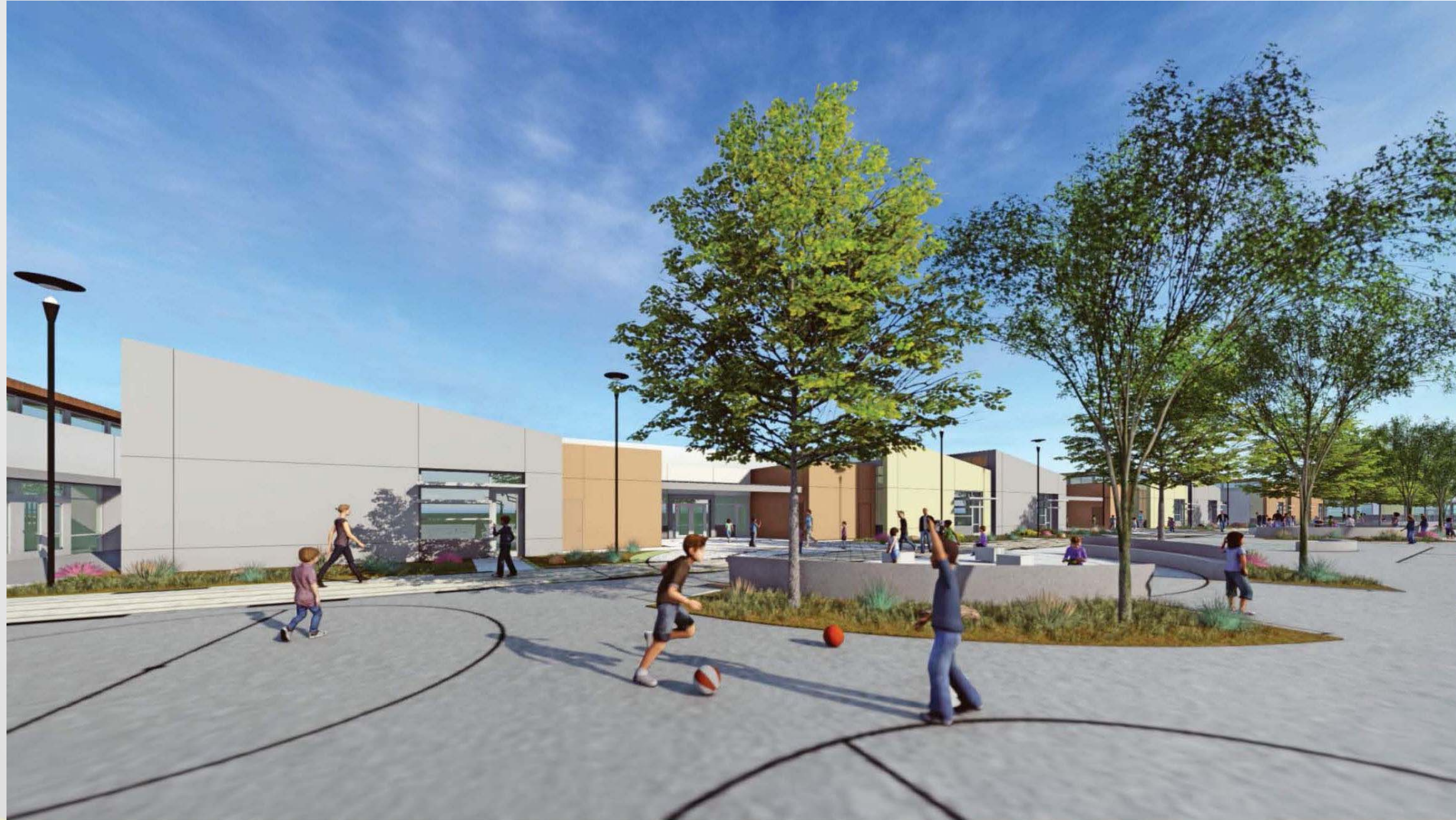
New Elementary School in Foster City - View from Playground, Looking East, of Outdoor Learning Node and Classrooms