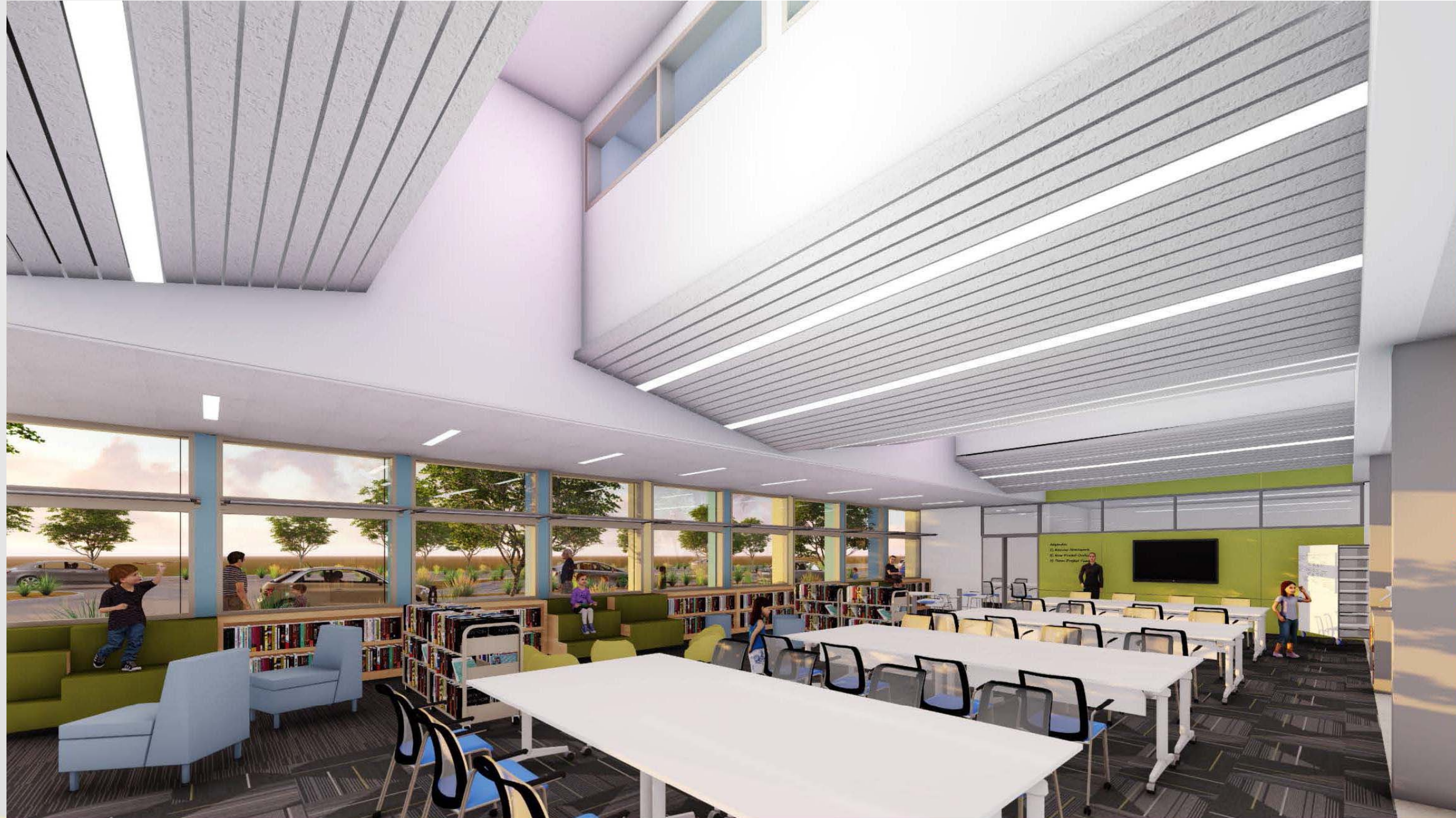
New Elementary School in Foster City - Interior View of Library