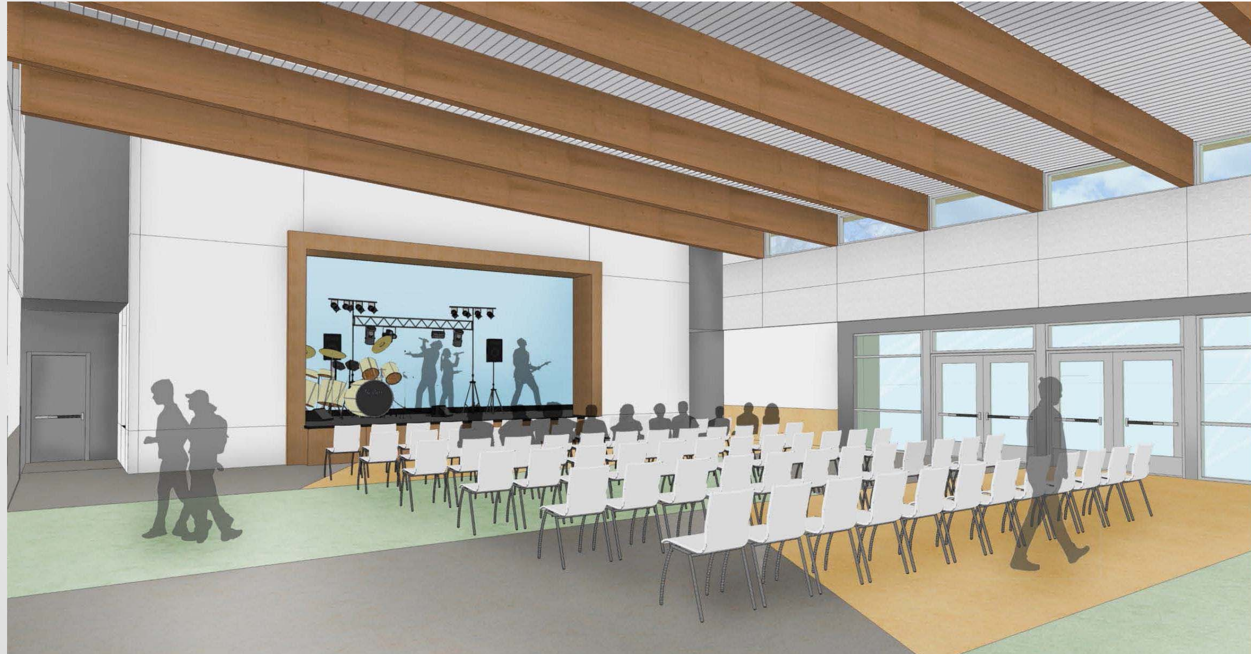
New Elementary School in Foster City - Interior View of Multi Use Building