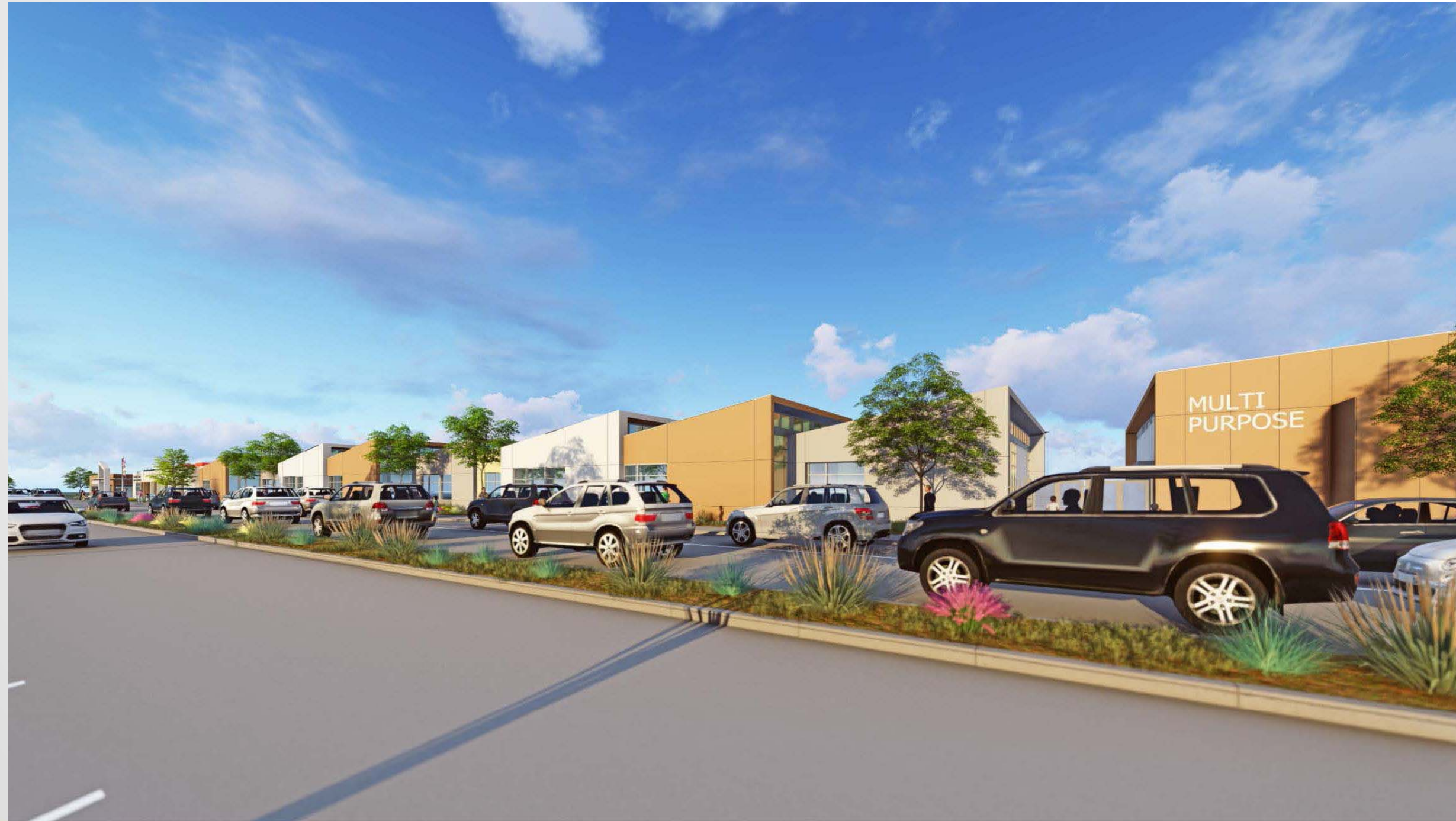
New Elementary School in Foster City - View from Shell Blvd, Looking South-West, of Passing & Drop-off Queuing Lanes