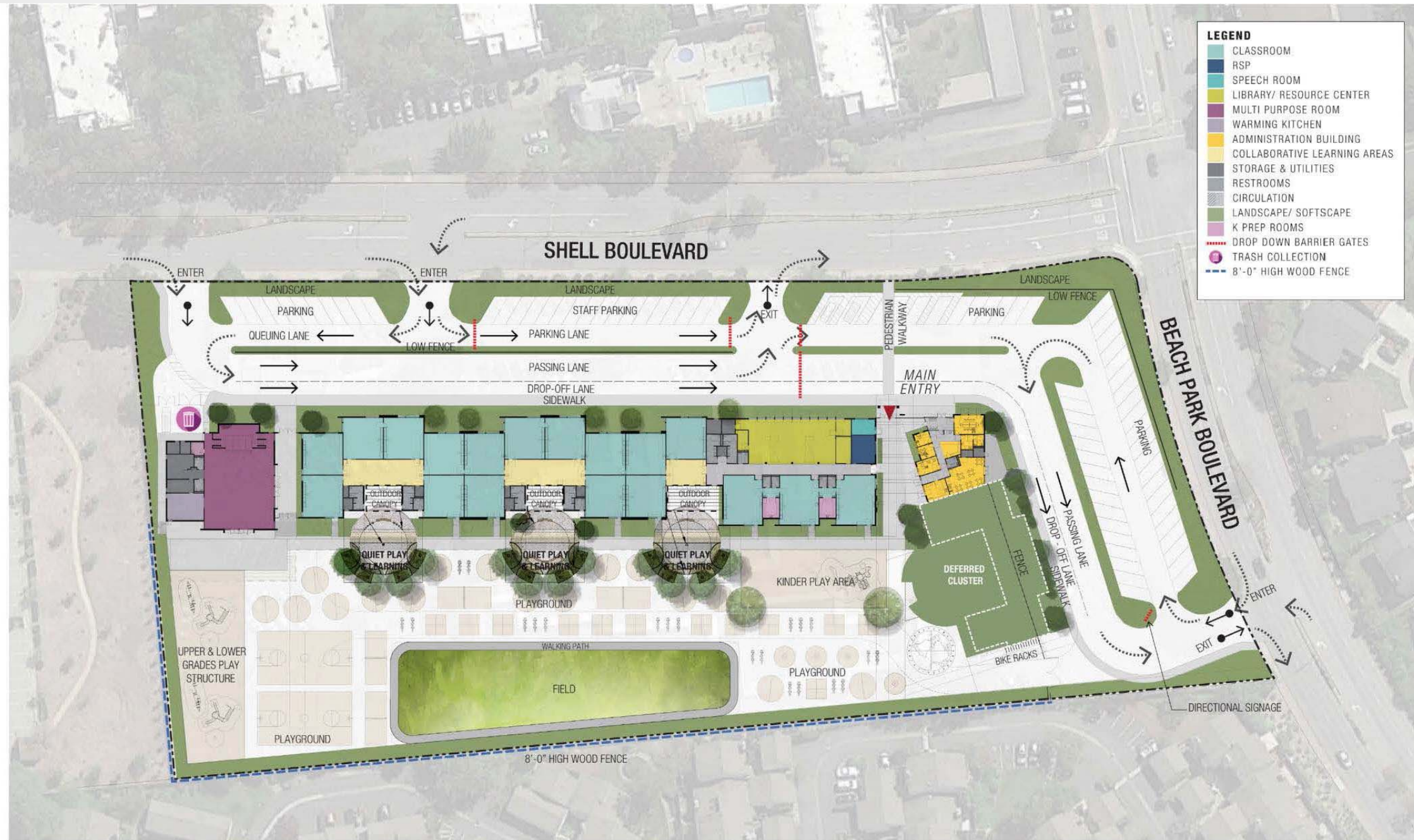
New Elementary School in Foster City - Conceptual Site Plan