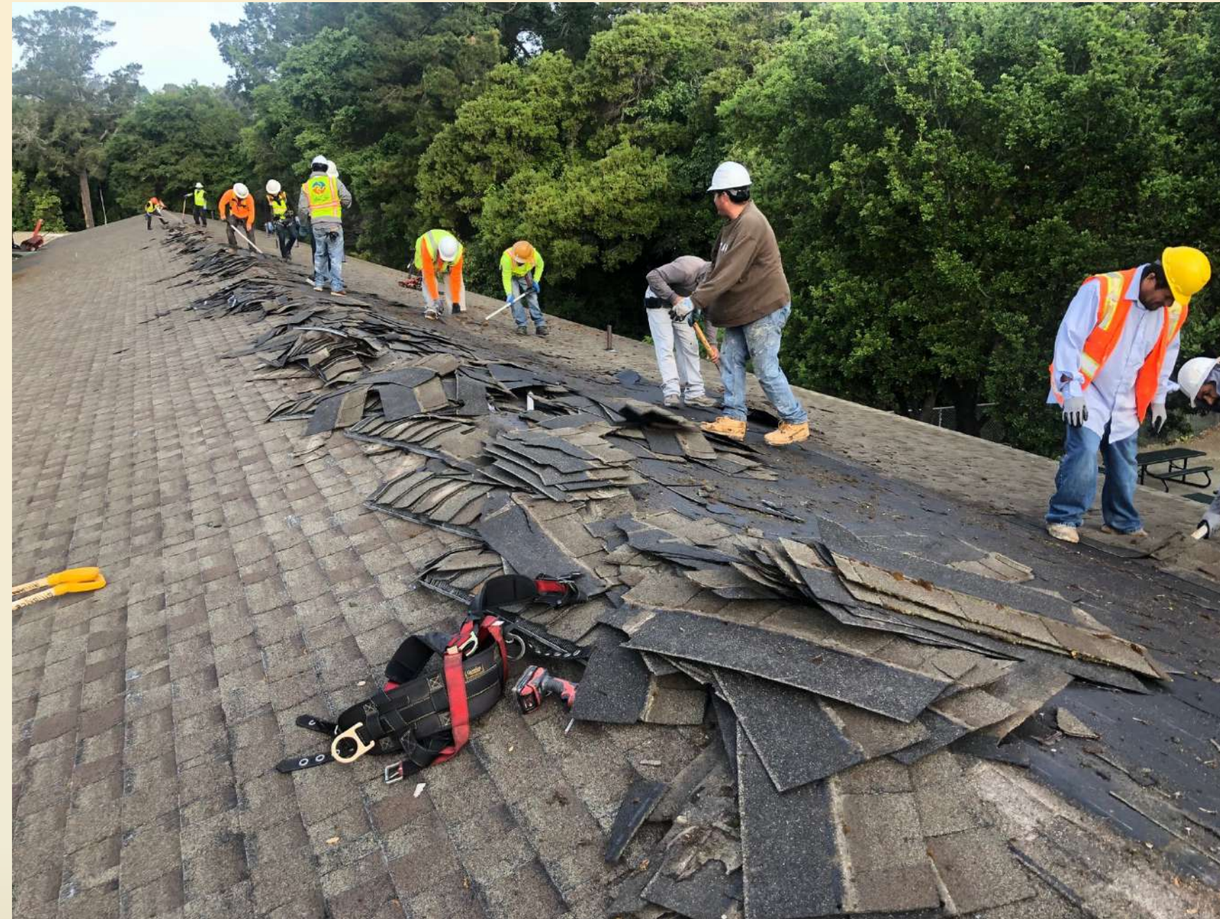
ROOF DEMOLITION WING 3