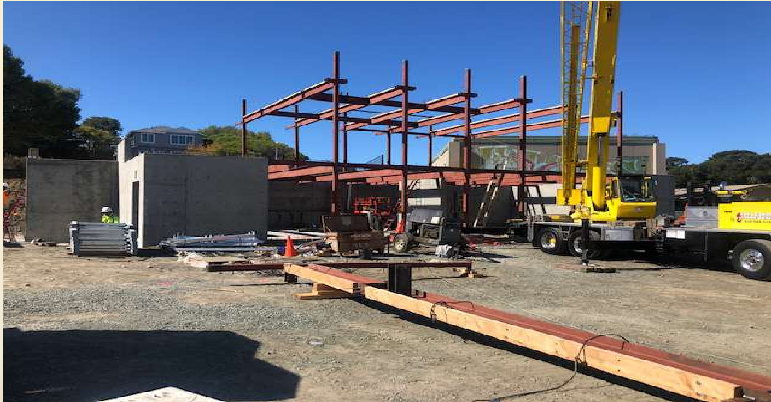
LOCKER ROOMS AND CLASSROOMS