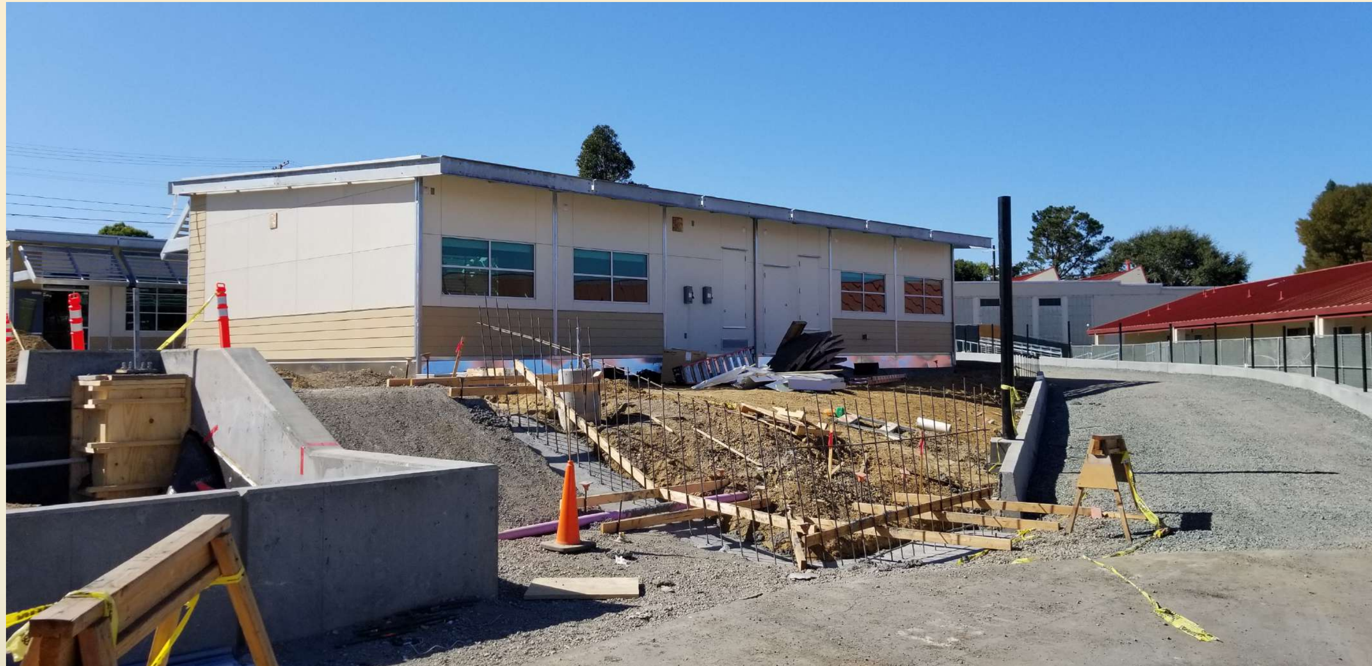
EMERGENCY VEHICLE ACCESS TO NEW ADDITION