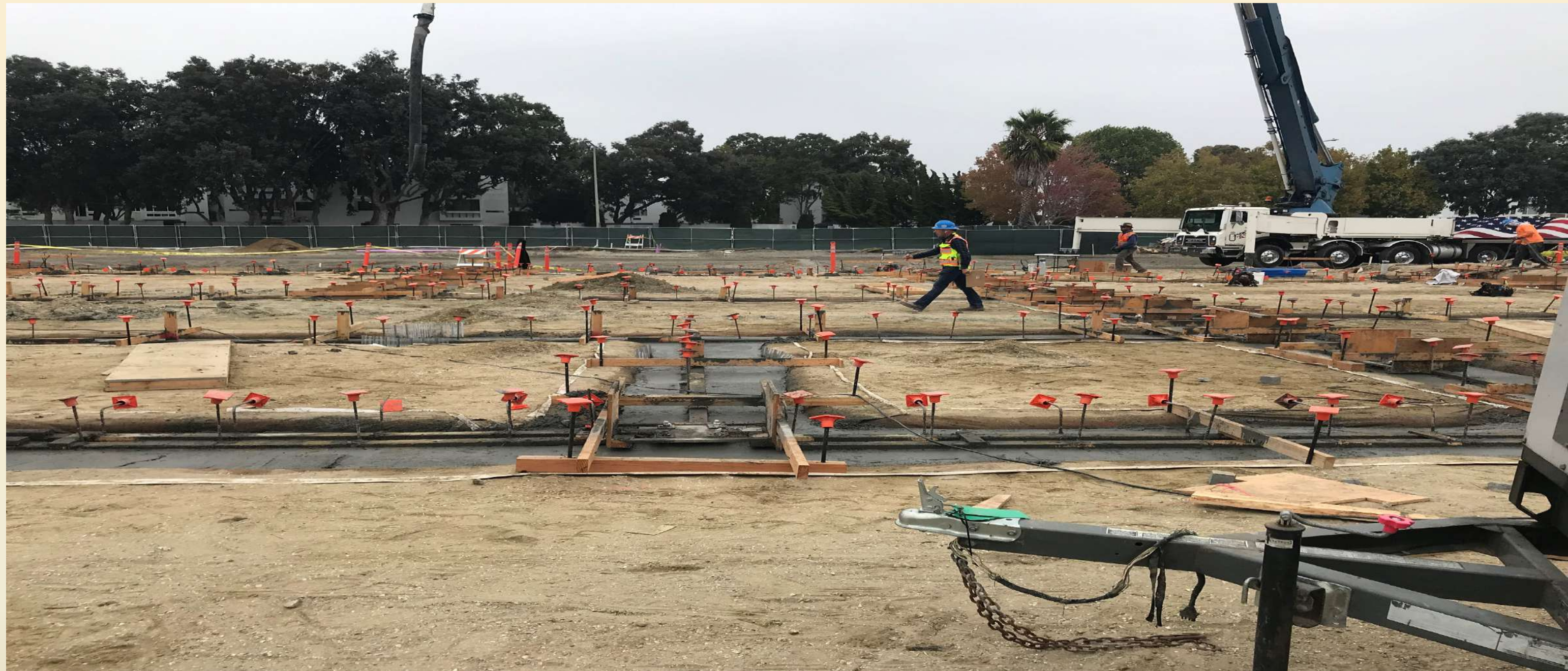
BUILDING FOOTING POUR B2