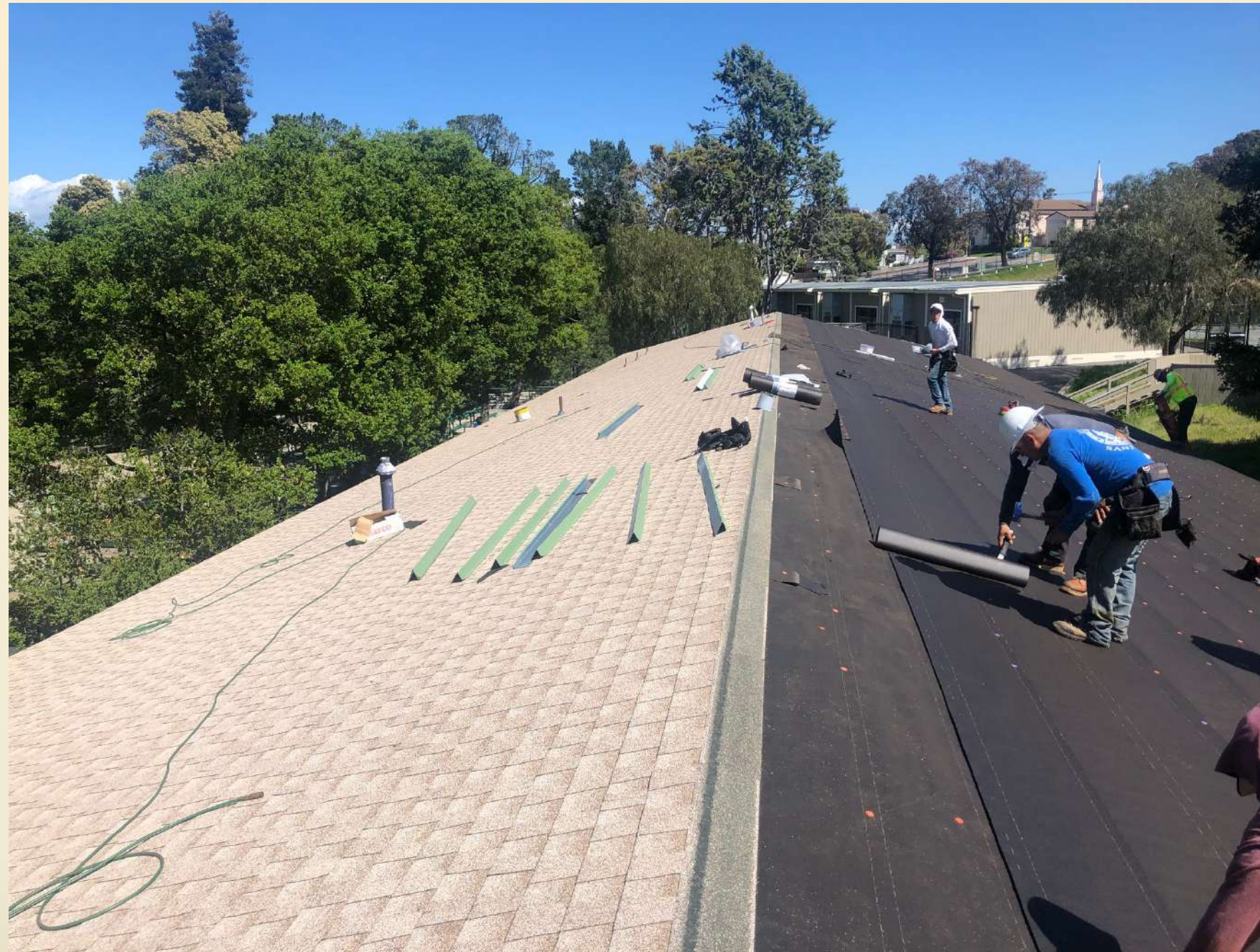
WING 3 SHINGLE ROOF INSTALLATION IN PROGRESS