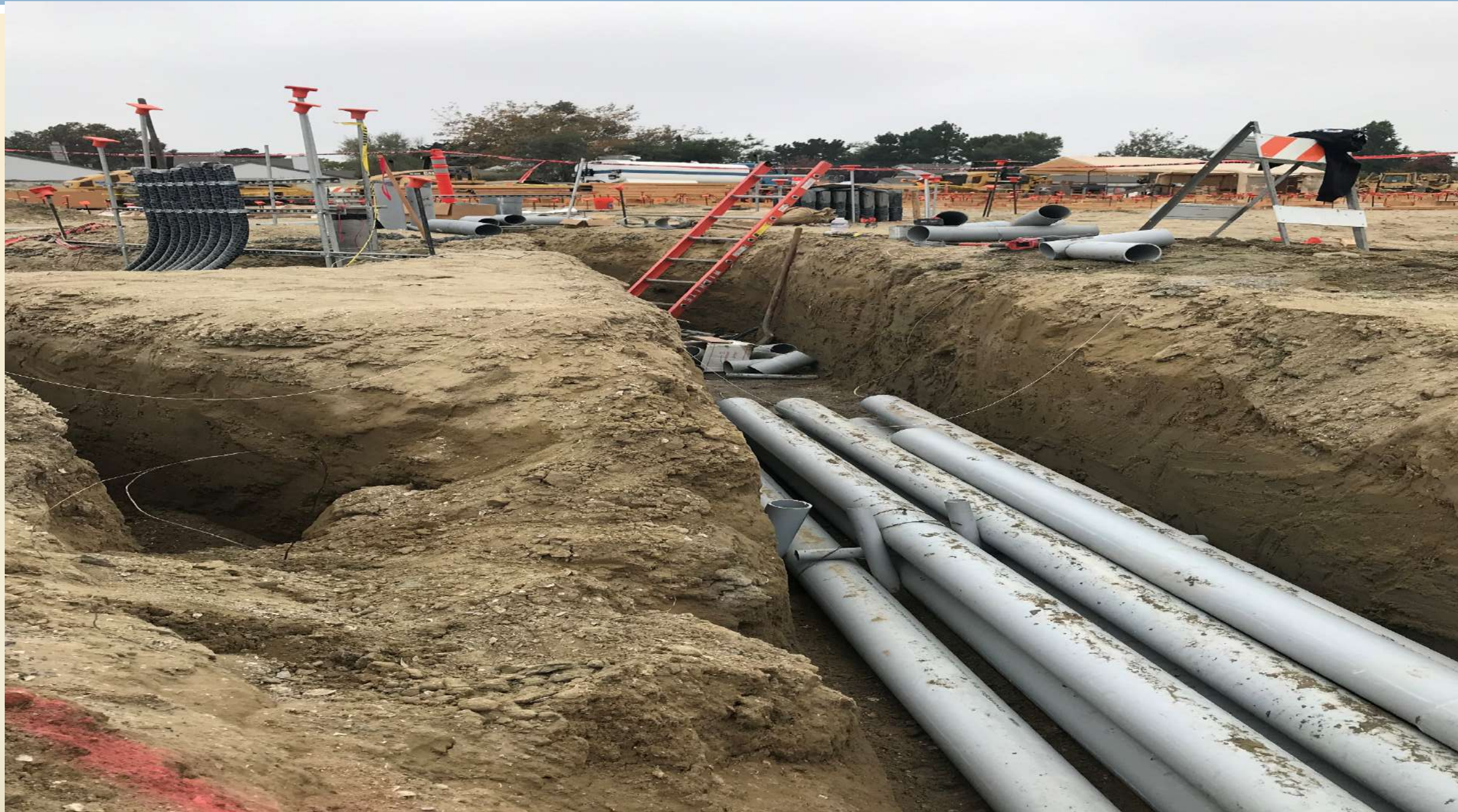
MAIN ELECTRICAL FEEDERS