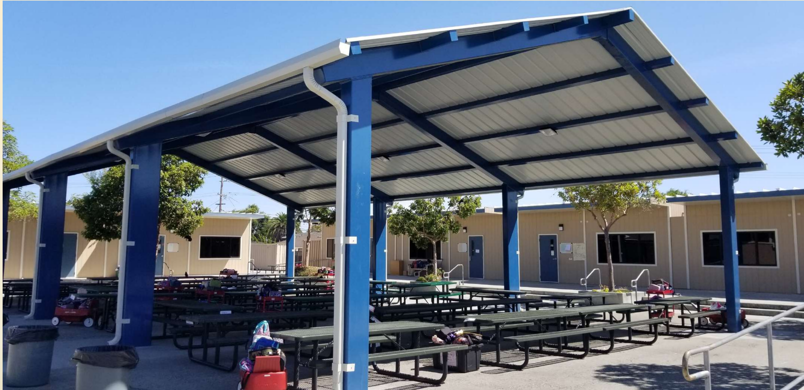
COMPLETED SHADE STRUCTURE WITH LIGHTING