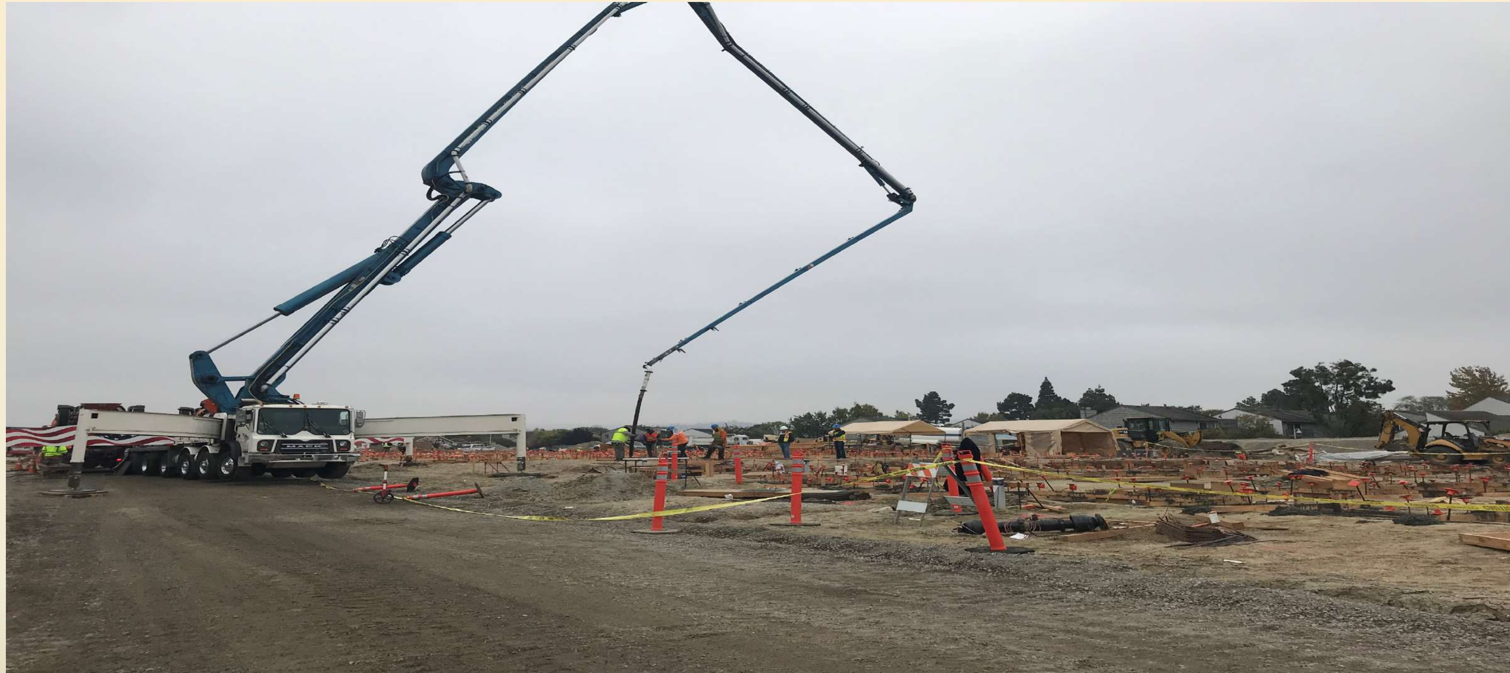
CONCRETE BOOM B1, B2