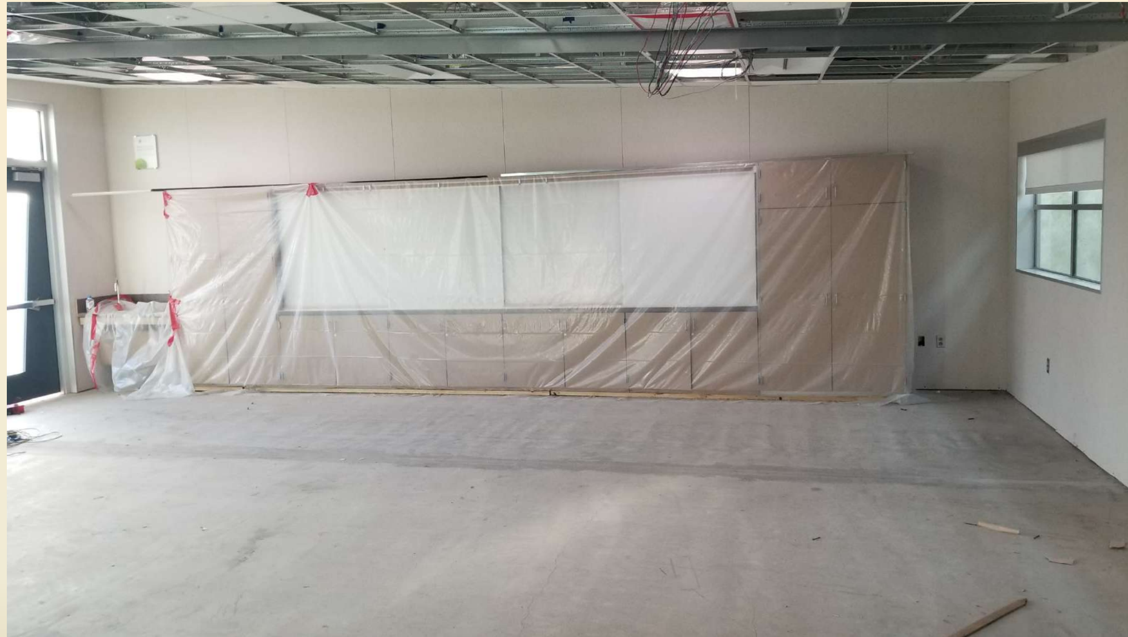
TYPICAL CLASSROOM INTERIOR