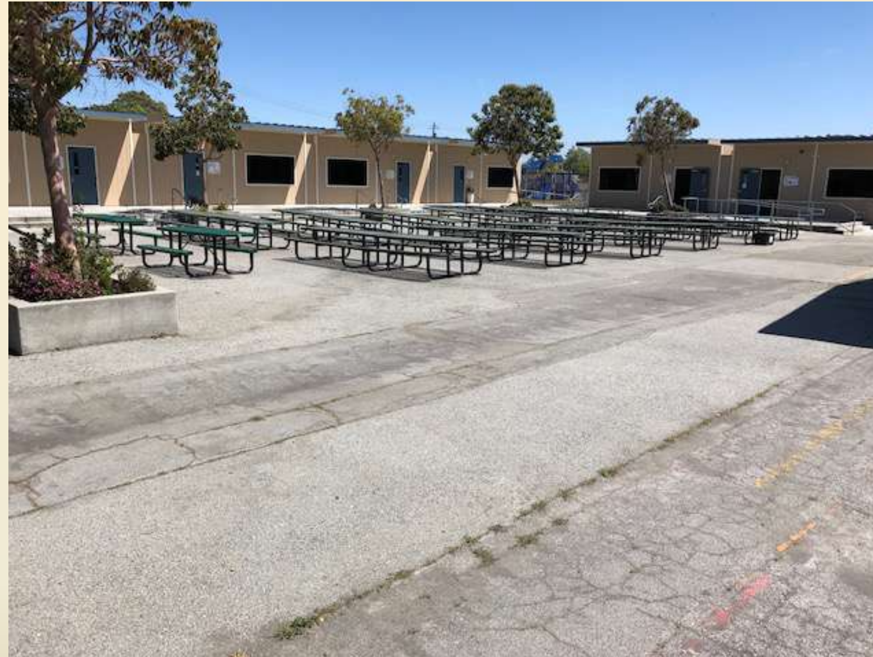
EXISTING LUNCH COURTYARD PRIOR TO SHADE STRUCTURE INSTALLATION