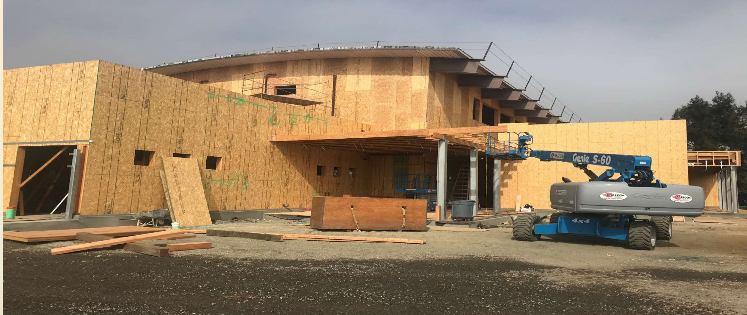
EXTERIOR OF NEW GYM