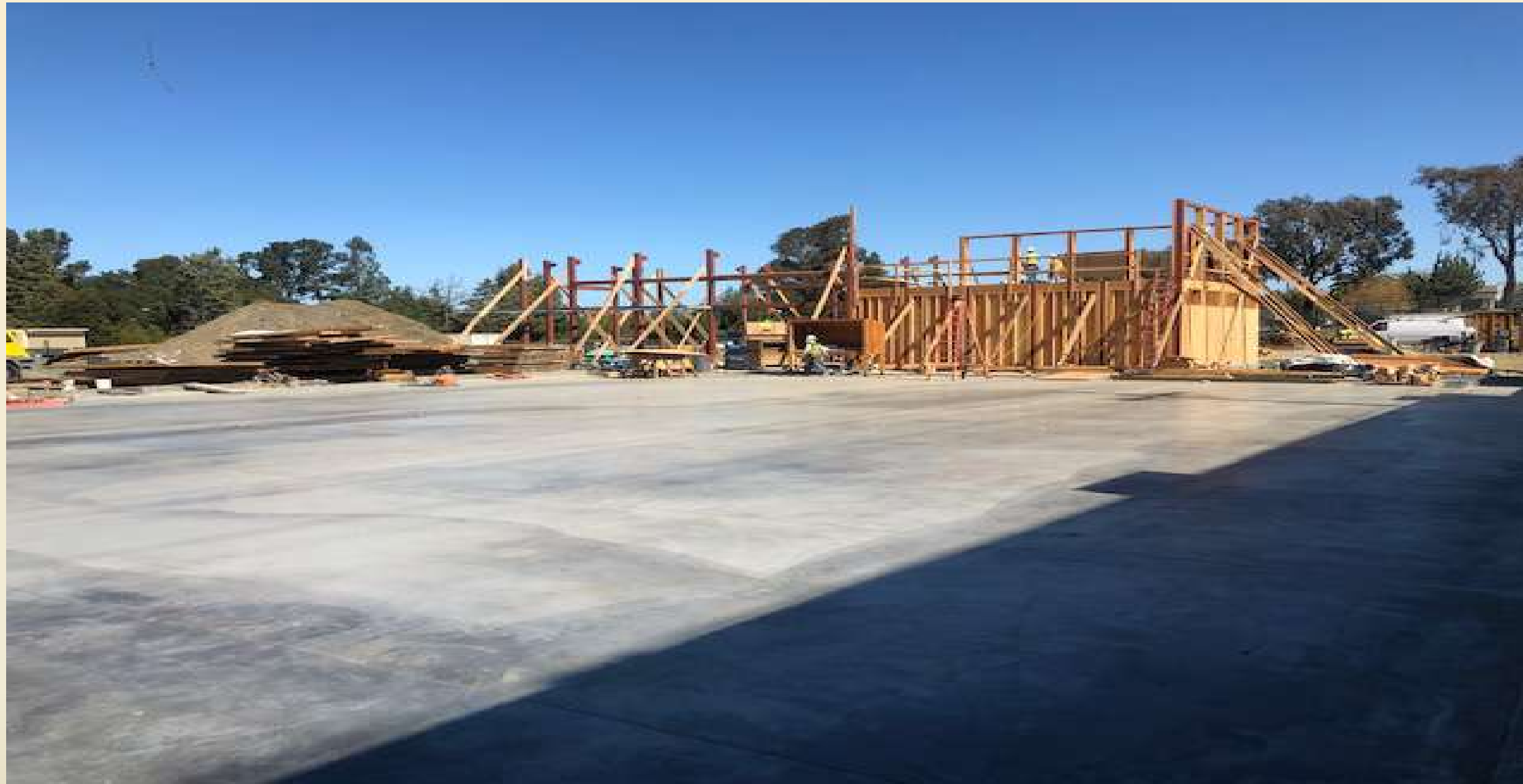
FROM THE GYM LOOKING AT THE LOBBY