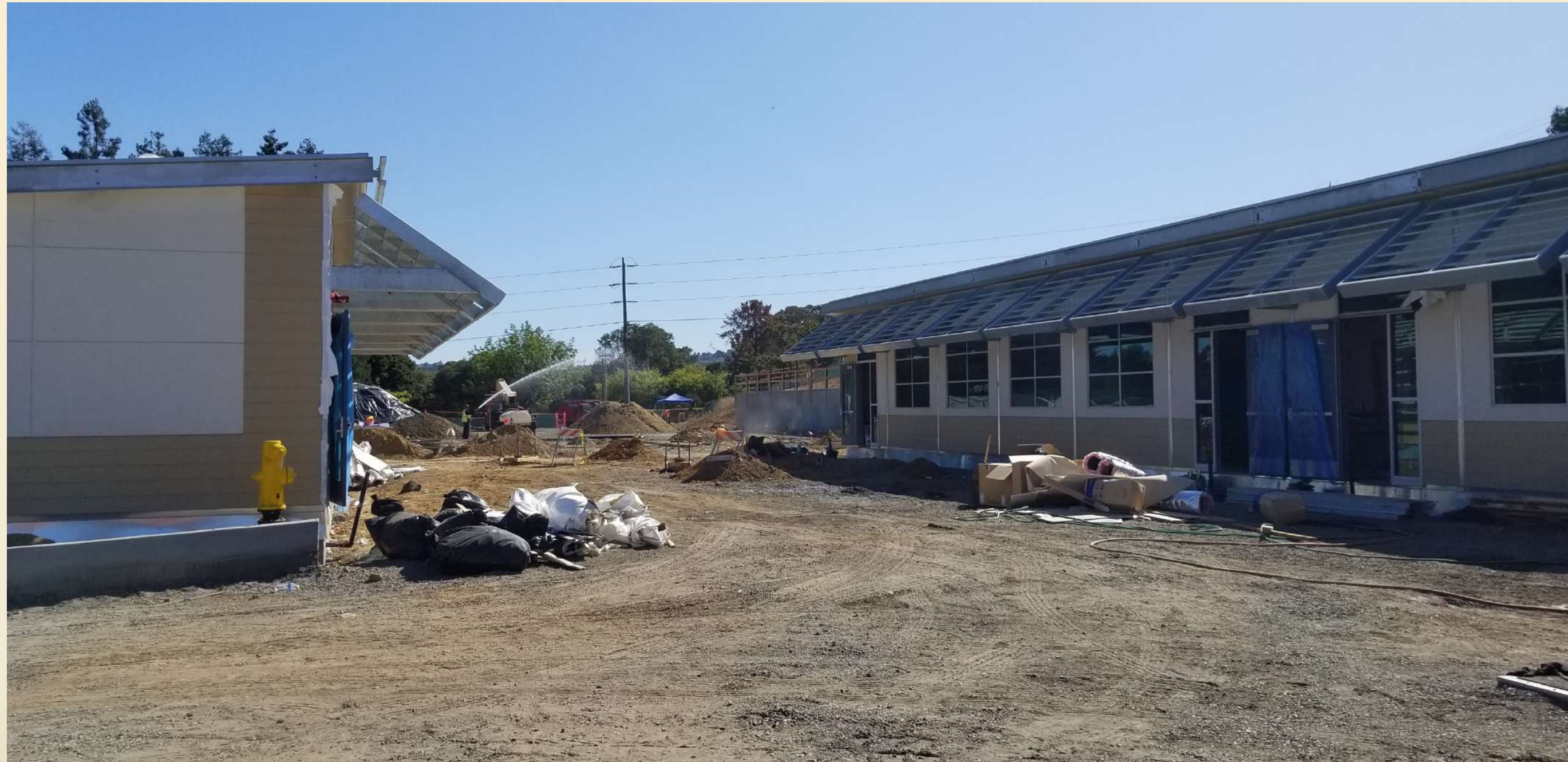
COURTYARD BETWEEN THE CLASSROOM BUILDINGS LEADING TO GYM