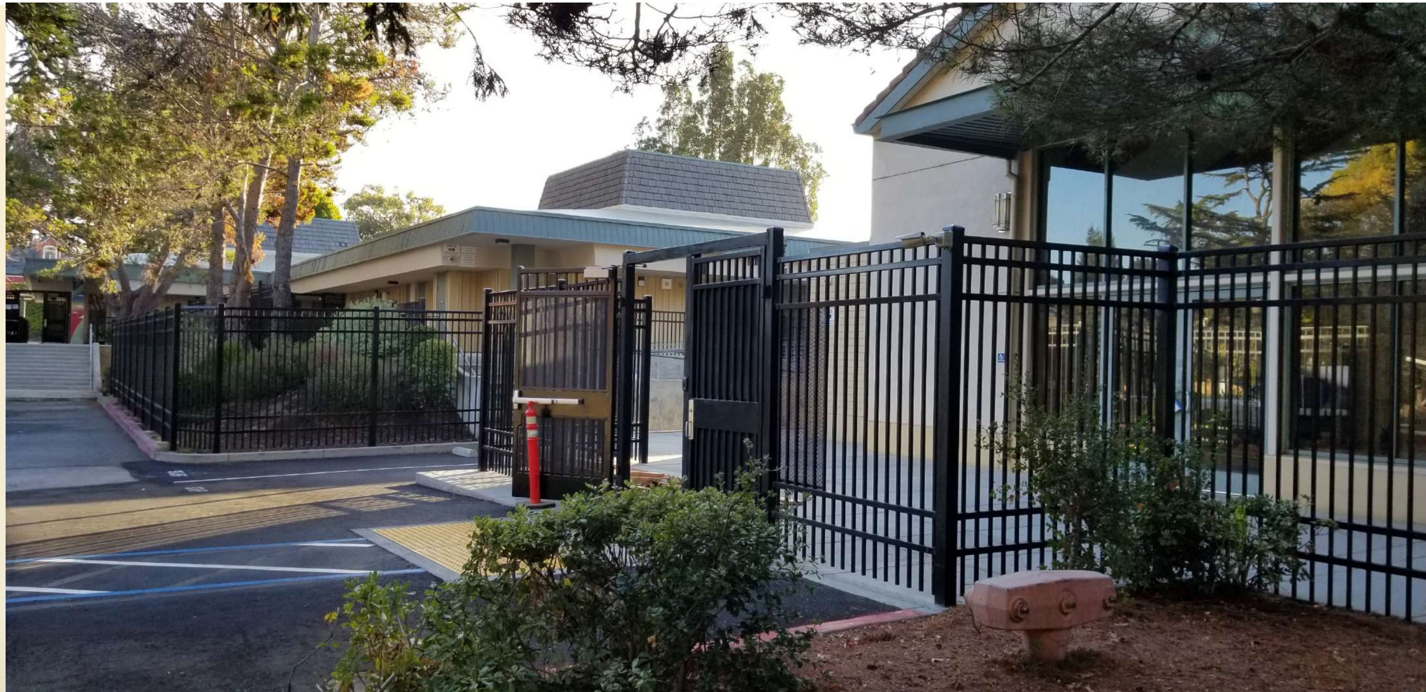
COMPLETED ORNAMENTAL FENCING LOOKING TOWARDS ADMIN. BUILDING