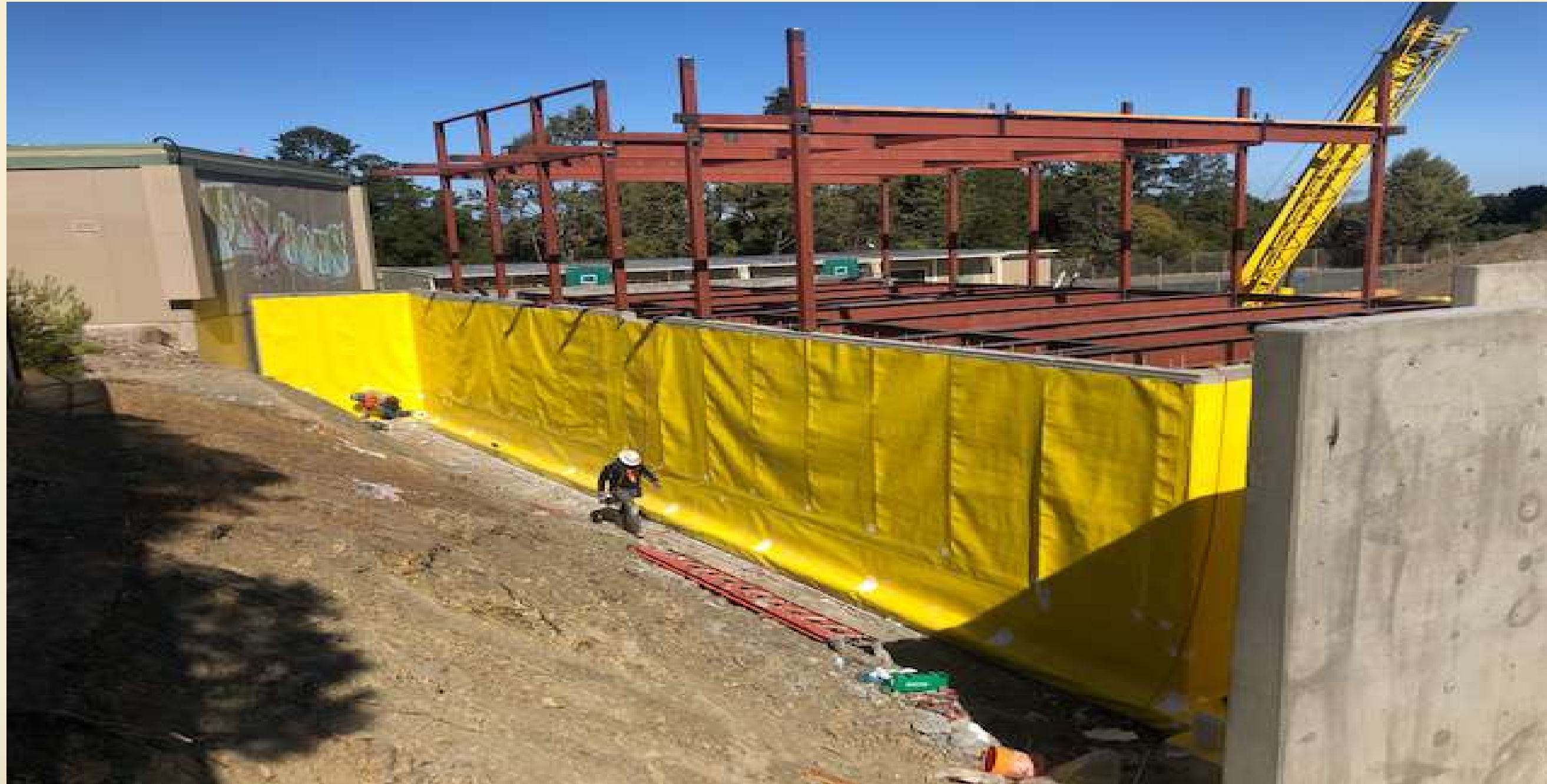
BACK OF LOCKER ROOMS, CLASSROOM BUILDING