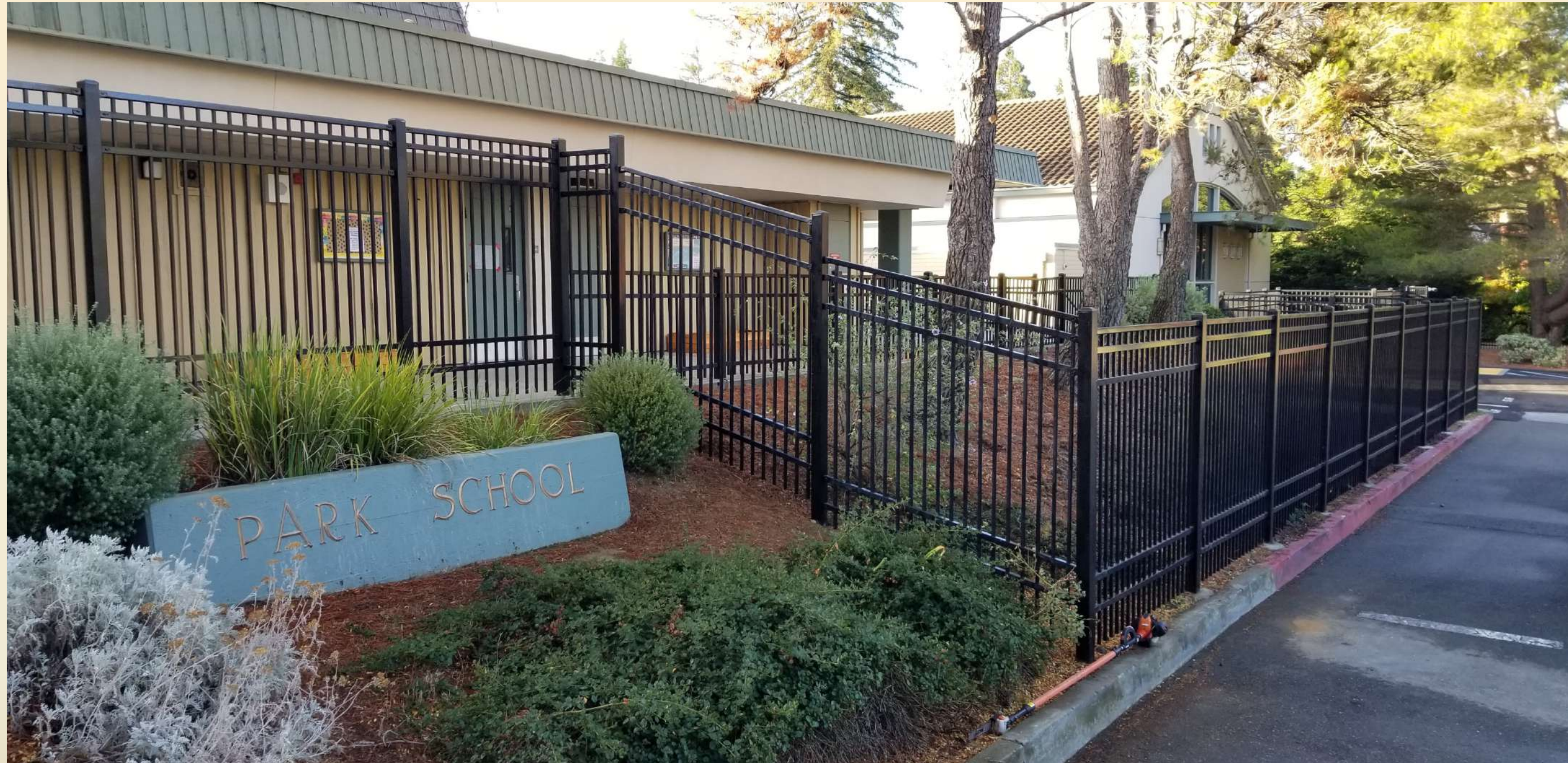
EXTERIOR TALLER FENCING AND SMALLER FENCING AT WALKWAY