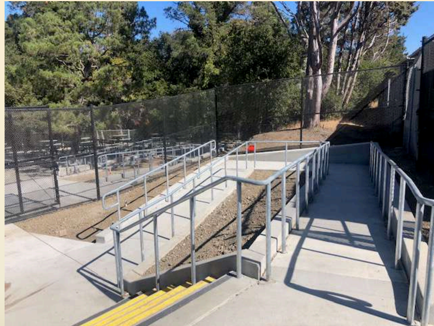
COMPLETED RAMP/STAIR FOR ACCESS TO LUNCH GROVE