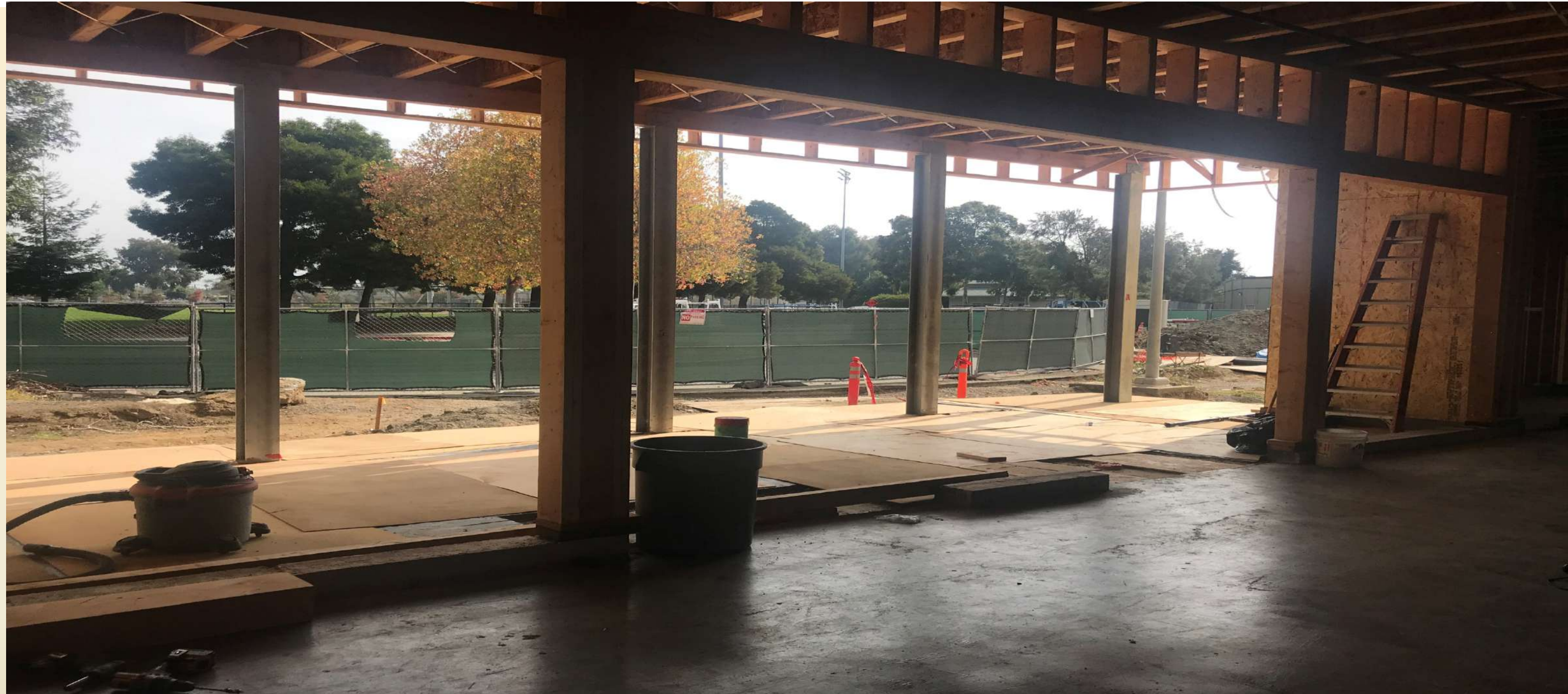
MAIN GYM LOBBY