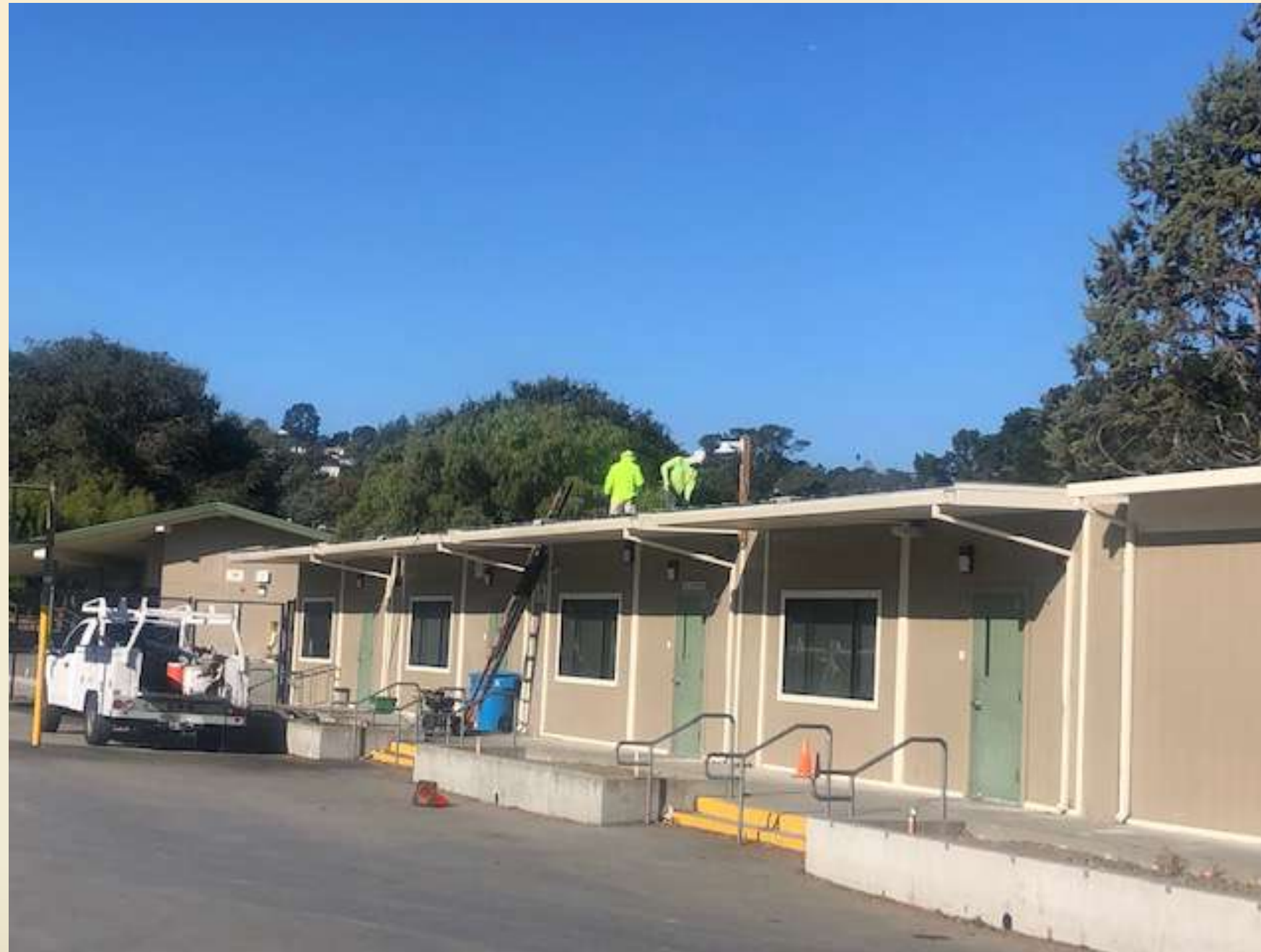
PORTABLE ROOFS TO RECEIVE NEW COATING