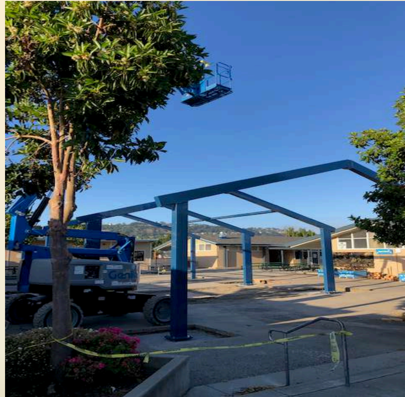
ASSEMBLY OF STEEL FRAMES FOR THE SHADE STRUCTURE