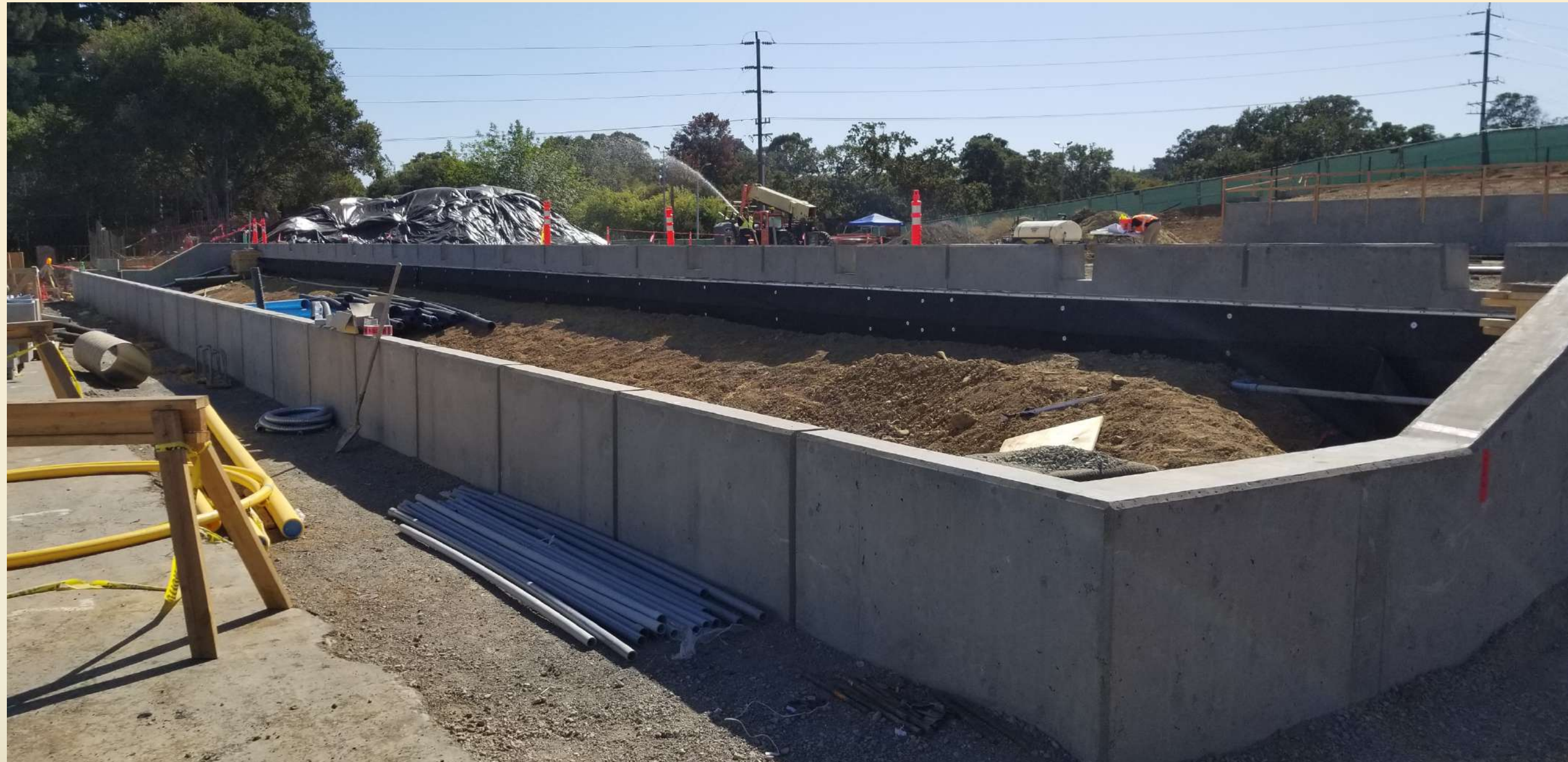
BIO SWALE FROM UPPER PLAZA TO LOWER YARD