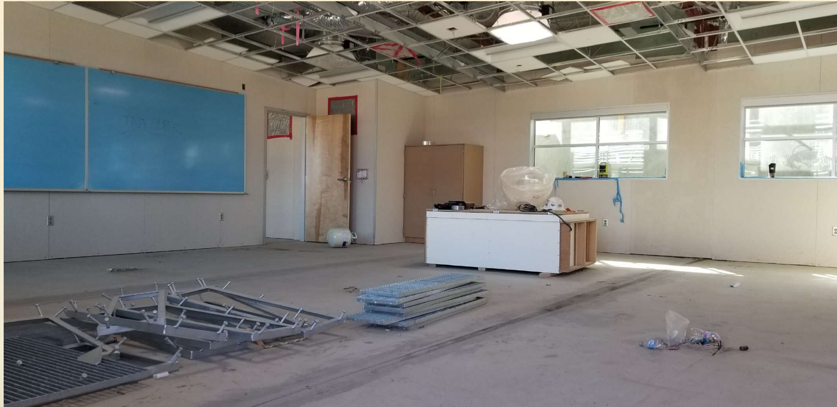
TYPICAL CLASSROOM INTERIOR