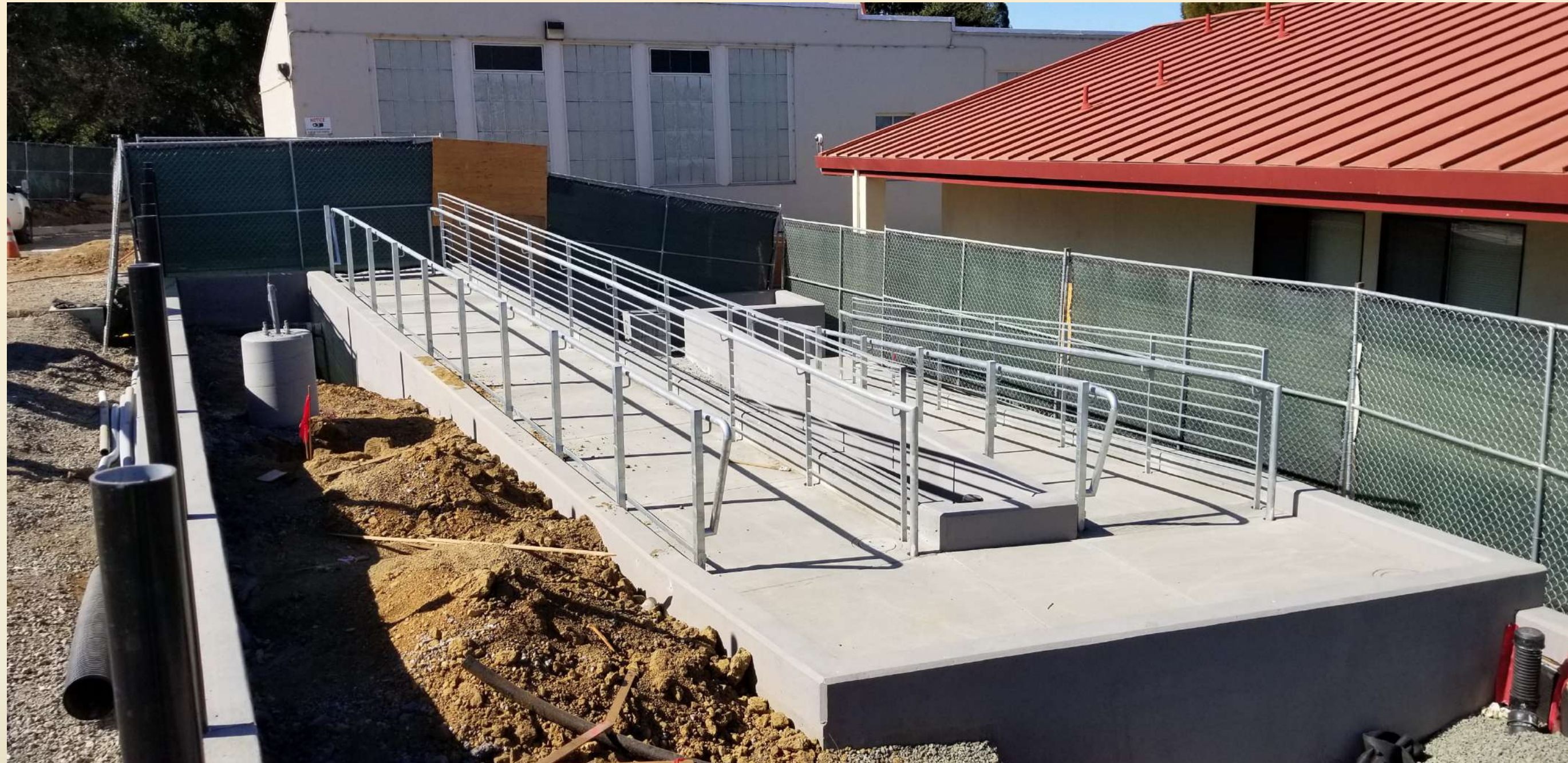
NEW RAMP FROM SCIENCE BUILDING TO NEW CLASSROOM COURTYARD