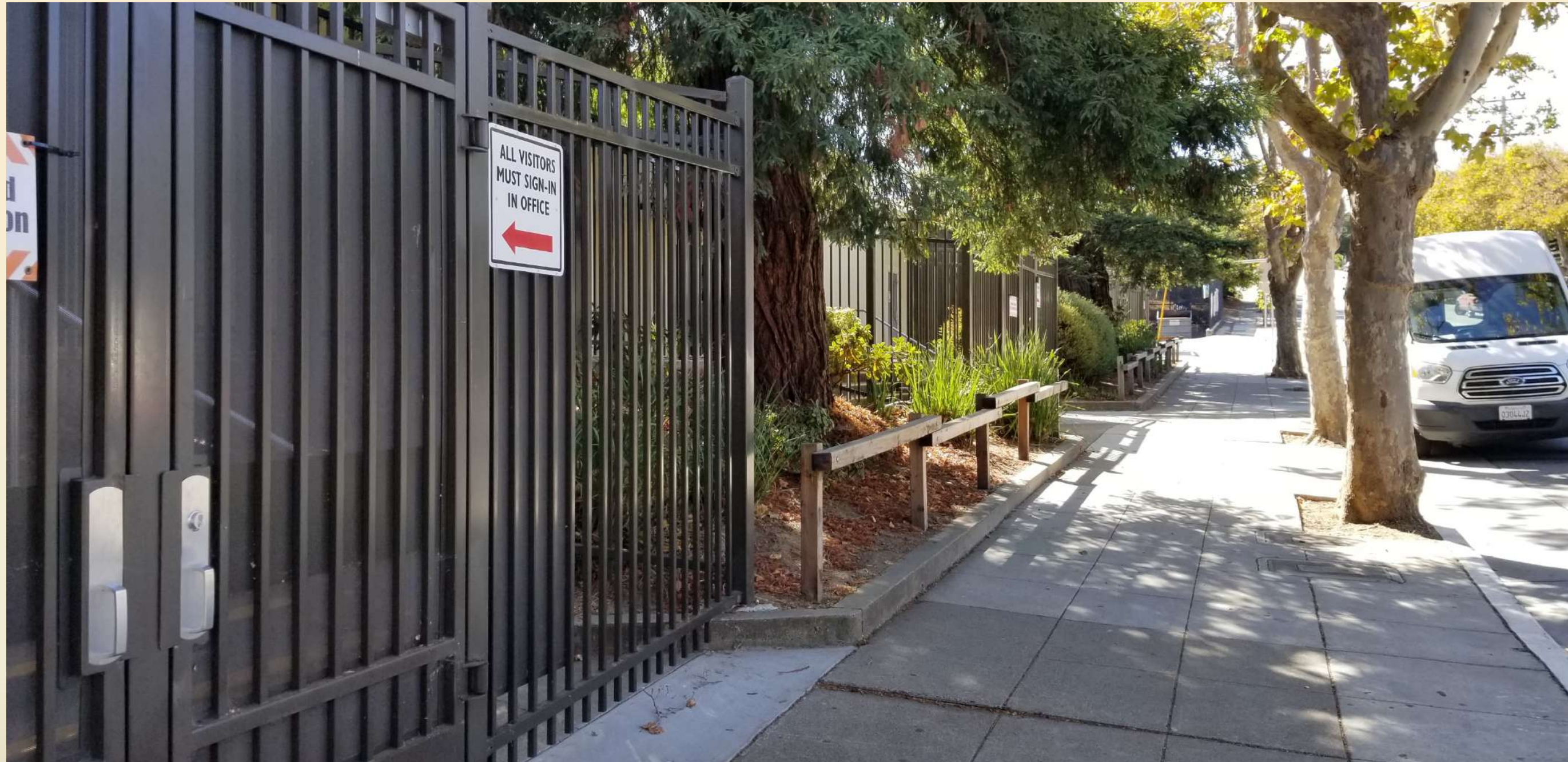
ORNAMENTAL FENCING ALONG FRONT OF SCHOOL AT BARNESON