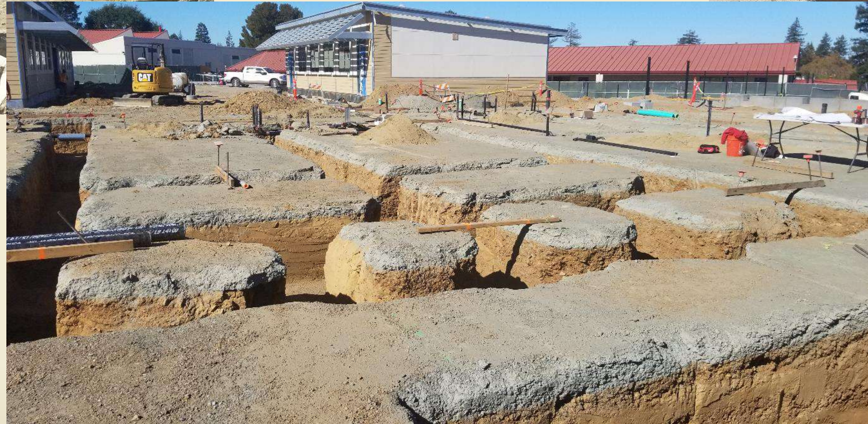
Borel Gym Underground Utility Trenching