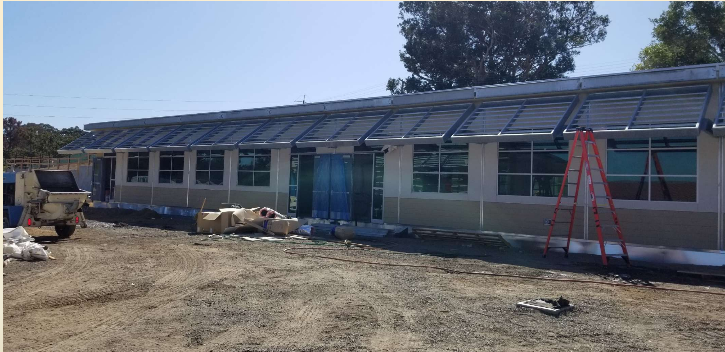
FOUR CLASSROOM CLUSTER MODULAR BUILDING