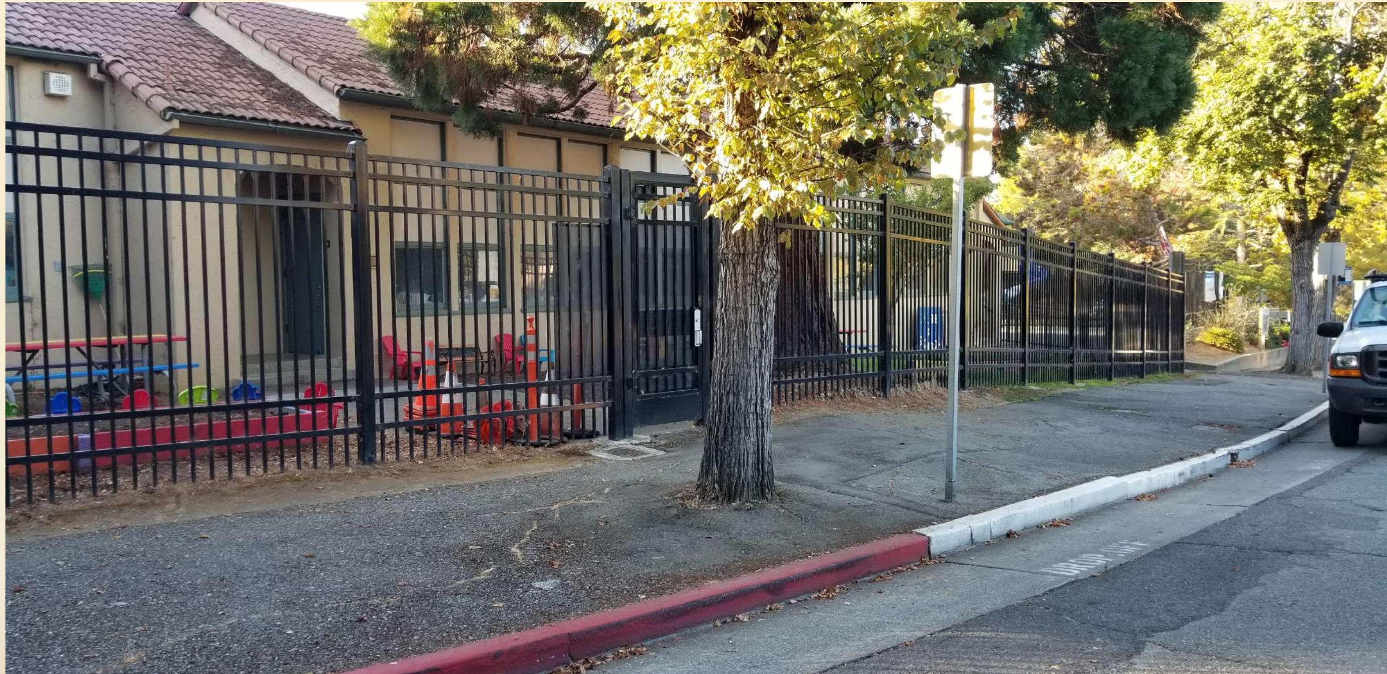
ORNAMENTAL FENCING AT FRONT OF SCHOOL ON CLARK DRIVE