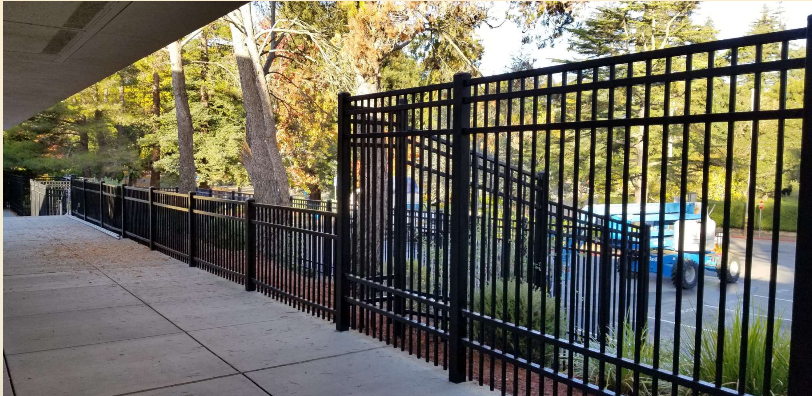
SMALLER FENCING AT WALKWAY IN FRONT OF ADMINISTRATION