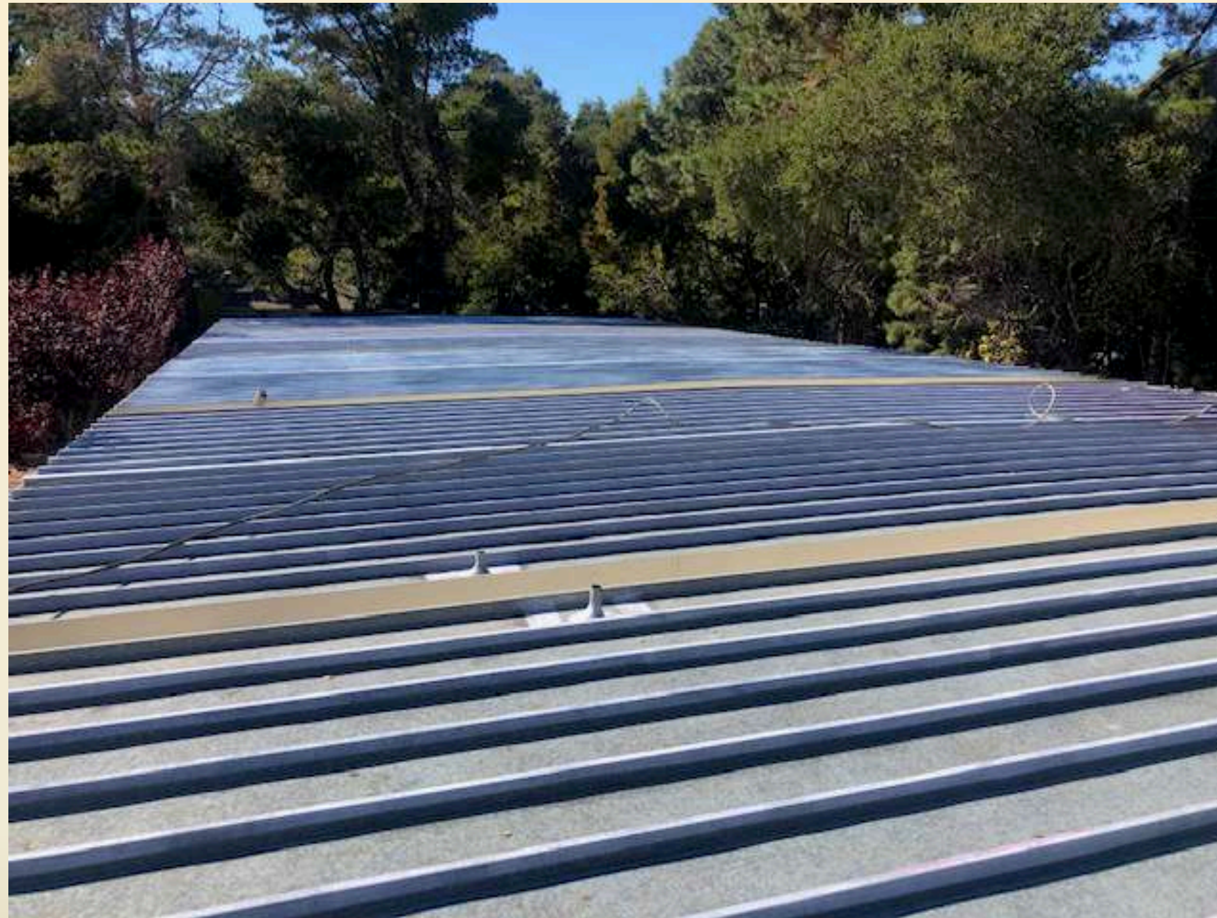
COMPLETED ROOF COATING AT PORTABLE ROOF