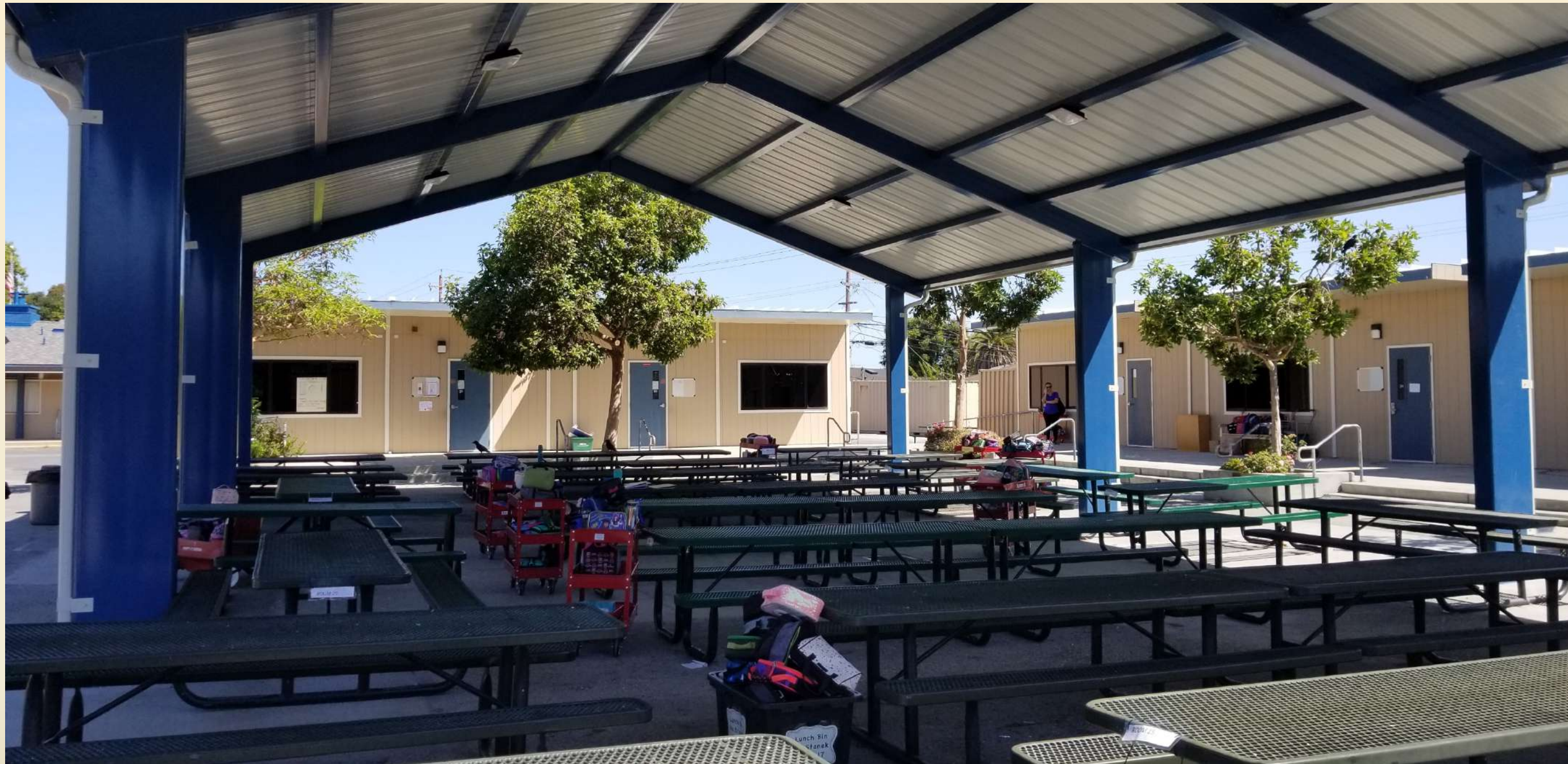
COMPLETED SHADE STRUCTURE WITH LIGHTING