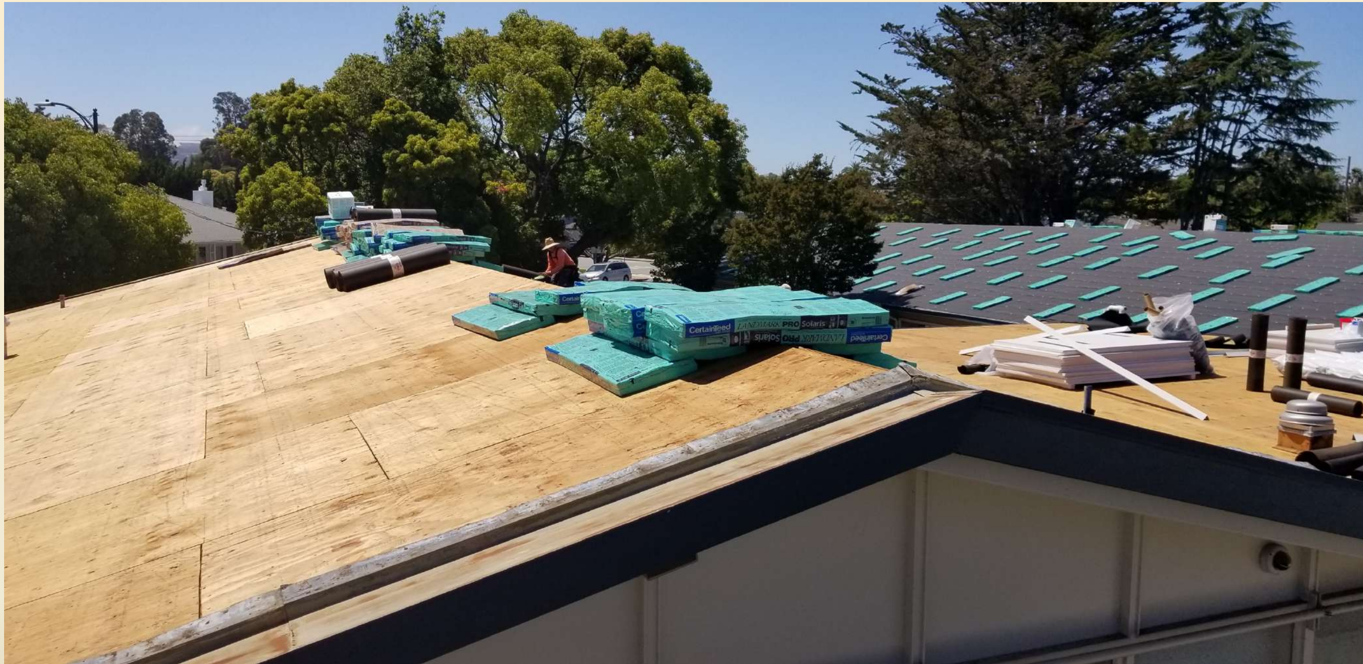
TYPICAL ROOFING INSTALLATION AT WINGS