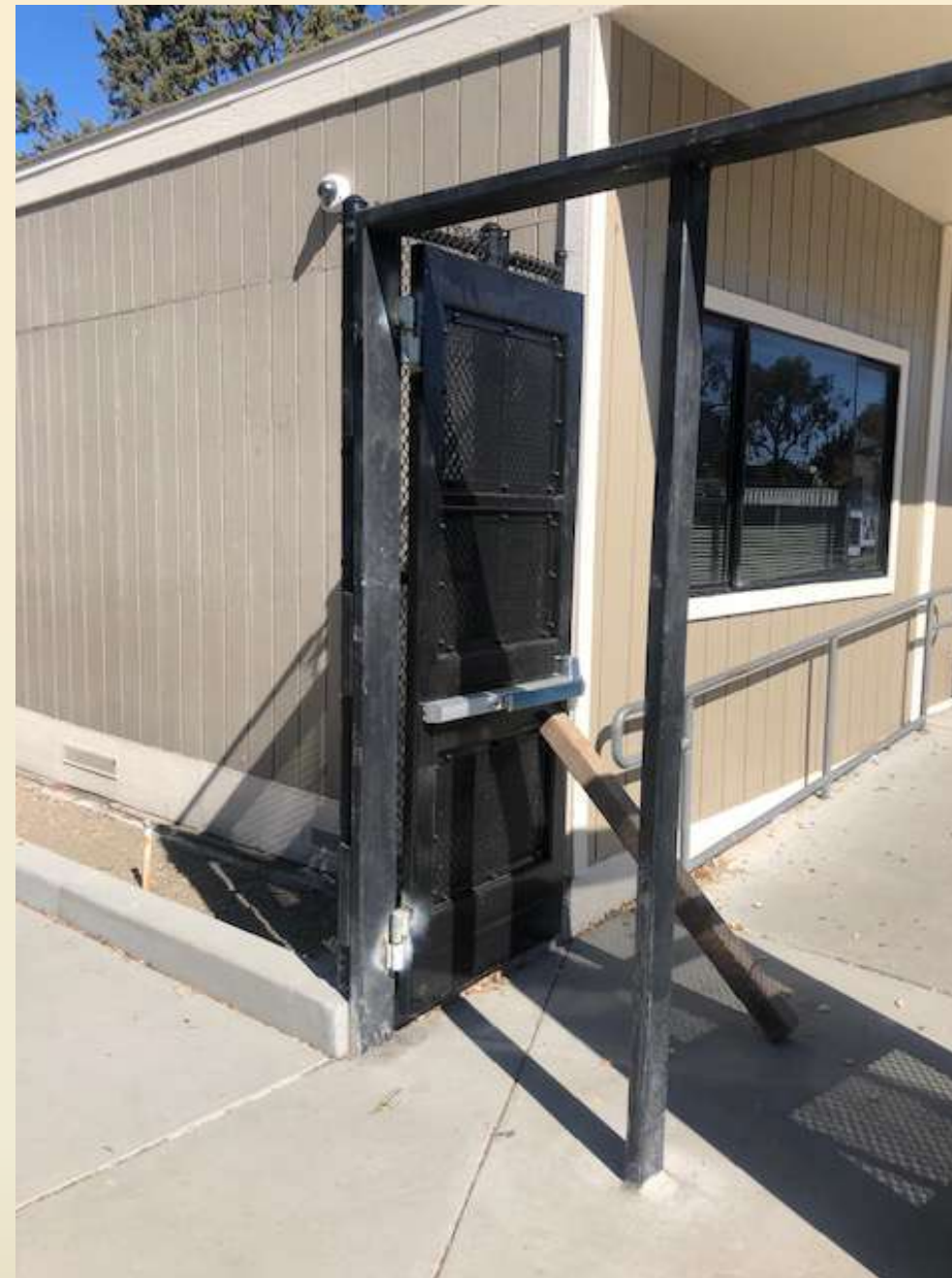
SECURITY FENCE GATE INSTALLATION