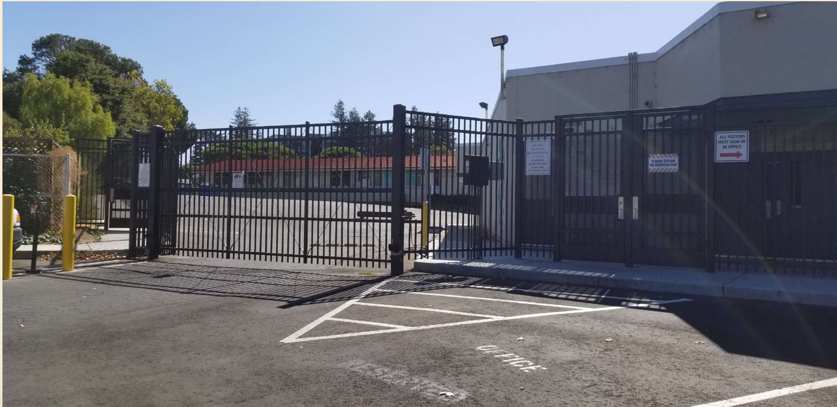
ORNAMENTAL FENCING WITH AUTOMATIC GATE AT BACK PARKING LOT