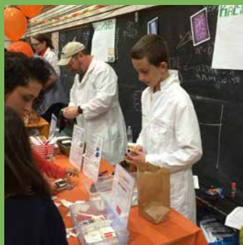
Revised August 2021

School Accountability Report Cards can be found on the SMFCSD website at www.smfcSD.net .