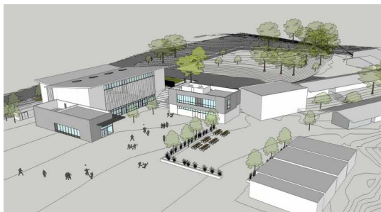
Rendering of new gym and classrooms at Abbott

about location and design and careful work by the architects and engineers charged with designing the new facilities.