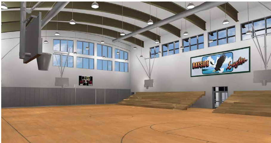
Interior rendering of gym at Bayside Academy

Once detailed construction documents are completed for each of these projects, they are submitted to California's Division of State Architect (DSA) for review and approval. The estimated time between submission and approval is six months.