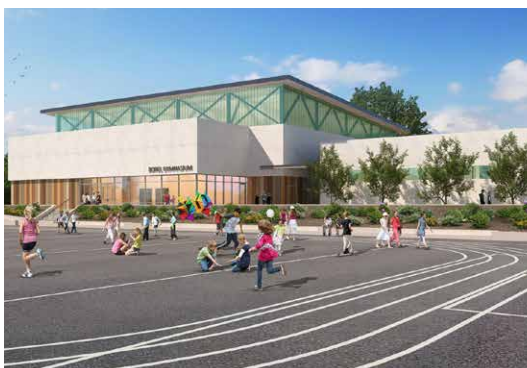
Rendering of new gym and classrooms at Borel

Phase I projects are experiencing a very competitive construction environment. All new projects, regardless of whether they are publicly or privately owned and financed, have experienced cost increases, the District's four projects are no exception. The Board of Trustees has had several discussions over the last year about cost increases and possible reductions while providing the needed facilities and keeping the District's commitment to the voters for all eight Measure X projects. Discussions and decisions will continue through the bidding process.