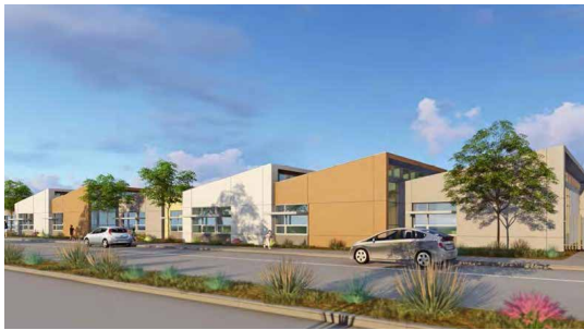
New Foster City School rendering

The new facilities projects at Abbott, Bayside and Borel Middle Schools and the new elementary school in Foster City will enter a much-anticipated stage of actual construction in 2018. Reaching this point has come after months of school and community input